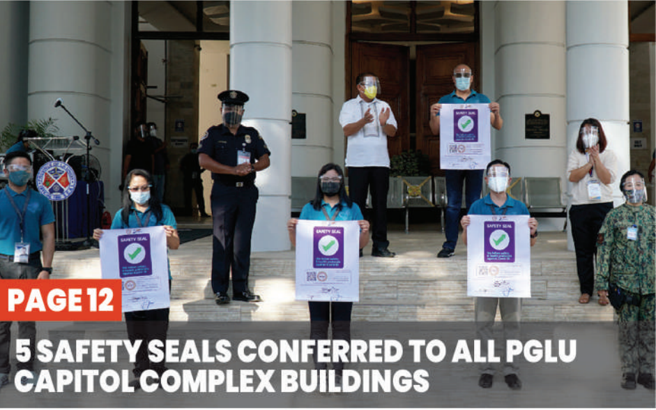
PAGE 12 5 SAFETY SEALS CONFERRED TO ALL PGLU CAPITOL COMPLEX BUILDINGS