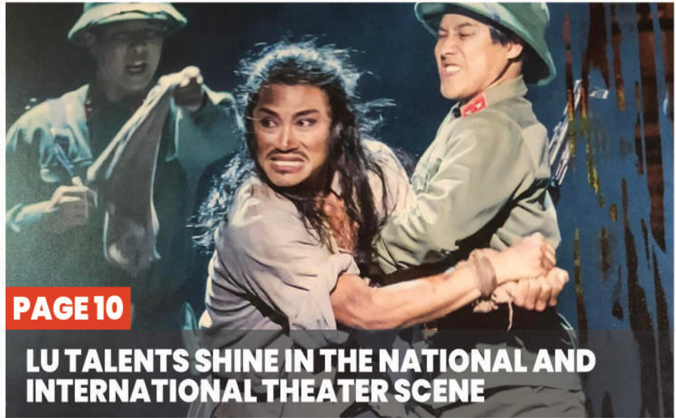
PAGE 10 LU TALENTS SHINE IN THE NATIONAL AND INTERNATIONAL THEATER SCENE

PSK 2021 might be slightly different with the previous PSK celebrations, but this year is a manifestation that #WeAreLaUnion, and we shall continue to move forward in building a #StrongerLaUnion, a province worth living in.