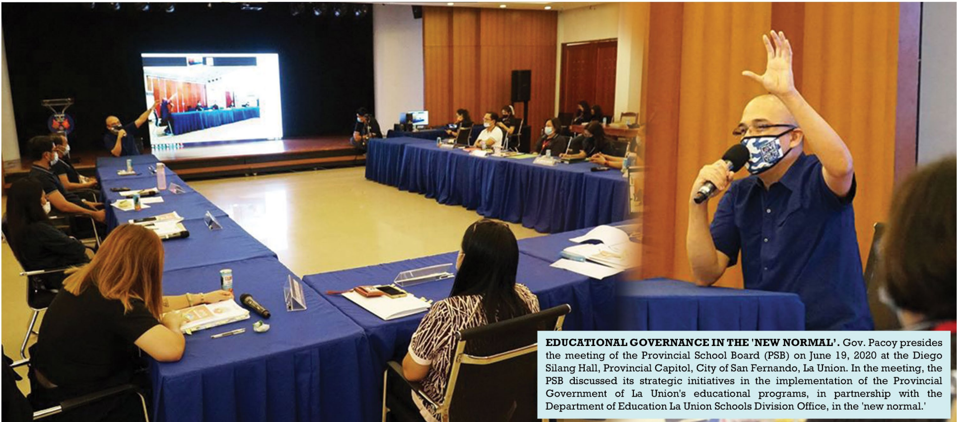
EDUCATIONAL GOVERNANCE IN THE 'NEW NORMAL'. Gov. Pacoy presides the meeting of the Provincial School Board (PSB) on June 19, 2020 at the Diego Silang Hall, Provincial Capitol, City of San Fernando, La Union. In the meeting, the PSB discussed its strategic initiatives in the implementation of the Provincial Government of La Union's educational programs, in partnership with the Department of Education La Union Schools Division Office, in the 'new normal.'