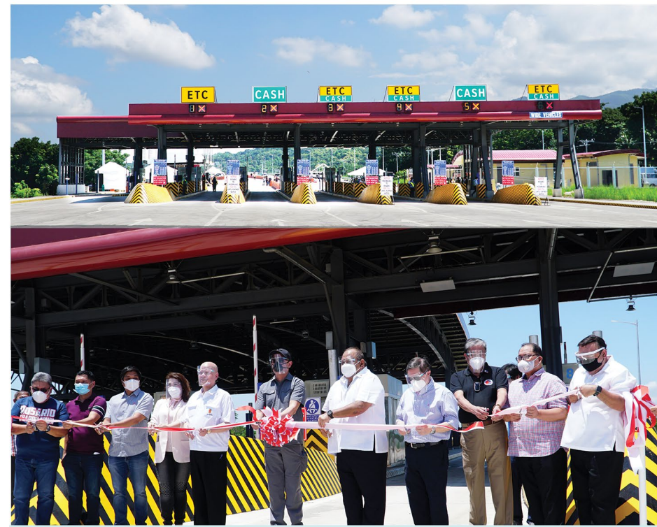
BUILDING ROADS, BUILDING FUTURE. Gov. Pacoy graces the Inauguration of the Rosario Exit of the Tarlac-Pangasinan-La Union Expressway (TPLEX) on July 15, 2020. The TPLEX Rosario Exit opens with the hopes for economic and tourism growth in North Luzon.

Gov. Pacoy ended the meeting saying that he will present the La Union Recovery Plan to the Provincial Development Council on June 25, 2020. He encouraged everyone to observe the Minimum Health Standards and said, "We have to accept and change our mind-set. The earlier we accept that, the faster we can move forward."