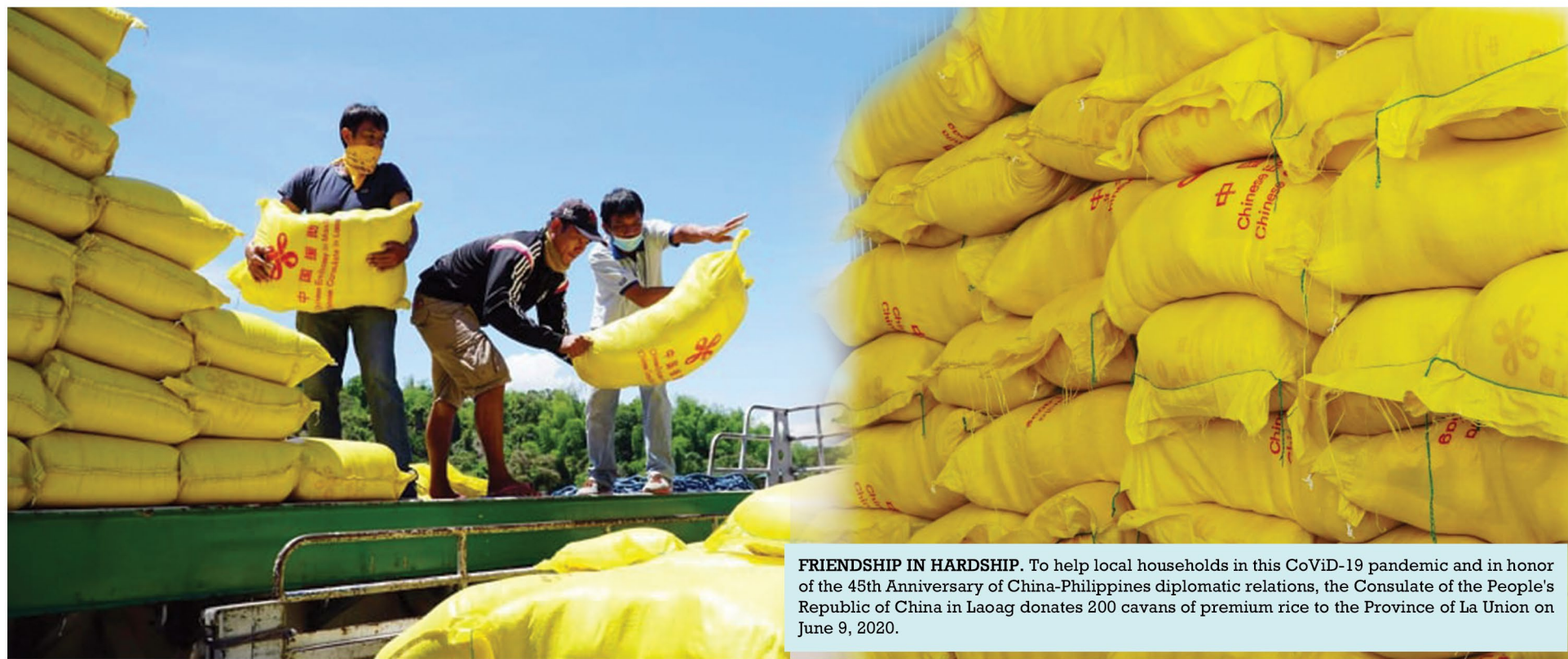
FRIENDSHIP IN HARDSHIP. To help local households in this CoViD-19 pandemic and in honor of the 45th Anniversary of China-Philippines diplomatic relations, the Consulate of the People's Republic of China in Laoag donates 200 cavans of premium rice to the Province of La Union on June 9, 2020.