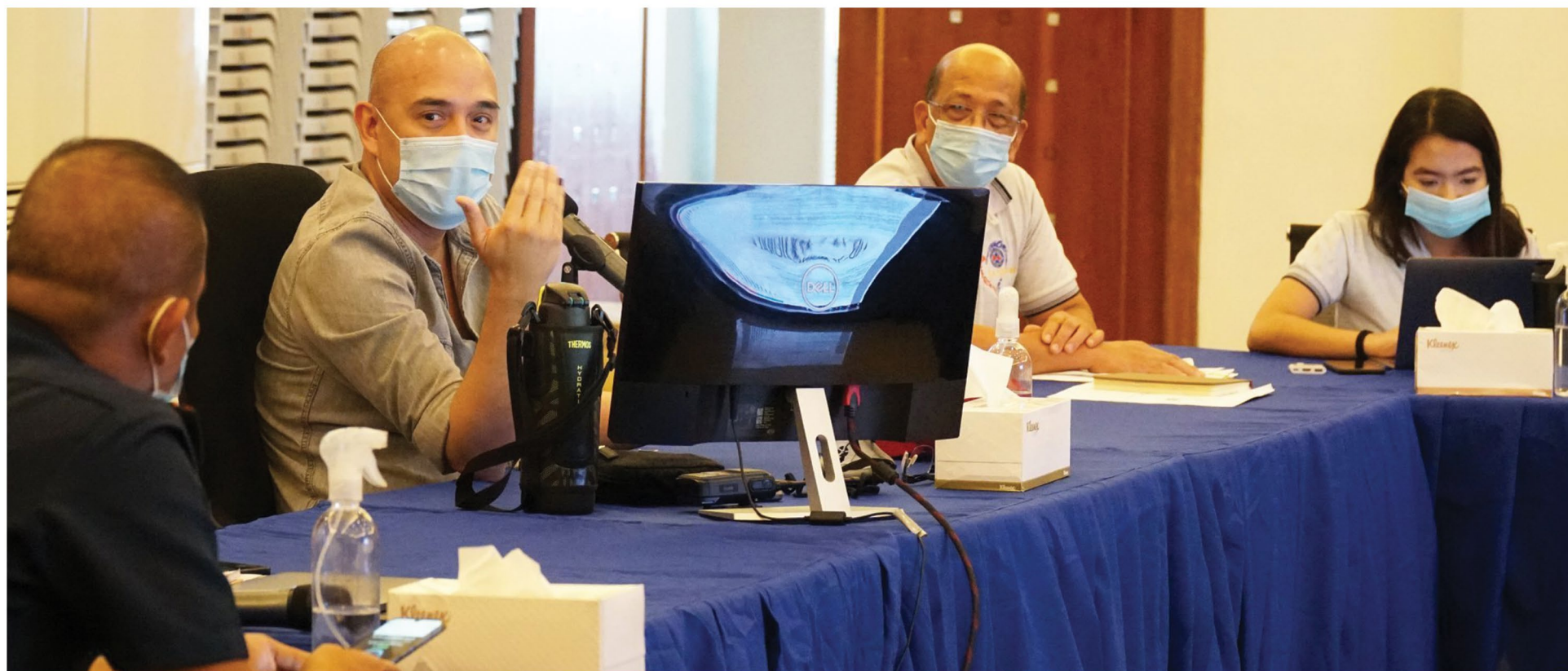
On July 13, 2020, Gov. Pacoy convenes the Provincial Core Team Against CoViD-19 (PCTAC) 2020 at Diego Silang Hall, Provincial Capitol, City of San Fernando, La Union.

During the meeting, the PCTAC discussed the current situation in the province and the different committees provided updates on the implementation of the strengthened counter CoViD-19 response measures.