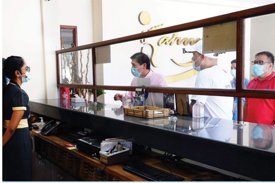
To ensure public safety, San Juan Municipal Mayor Arturo Valdez and Vice Mayor Mannix Ortega led the inspection of various accommodation establishments and restaurants in San Juan, La Union on June 16, 2020. The said monitoring assessed their compliance to Health & Safety Standards set by the government. Joining the municipal officials were Mr. Adamor Dagang representing Gov. Pacoy, Department of Tourism Region 1 Monitoring Team, and representatives of the Department of Trade and Industry Region 1, MDRMO, PNP, BFP, Business Licensing Office, and Tourism Office.