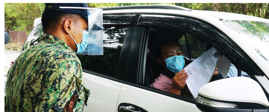
To guarantee continued safety in the province, representatives from the Provincial Government of La Union monitors the checkpoints in the entry and exit points in the Second District of La Union on June 16, 2020.

Manning the checkpoints in Tubao, Rosario and Pugo boundaries were from the Provincial Health Office and Provincial Disaster and Risk Reduction and Management Office, Philippine National Police, Philippine Army and Bureau of Fire Protection.