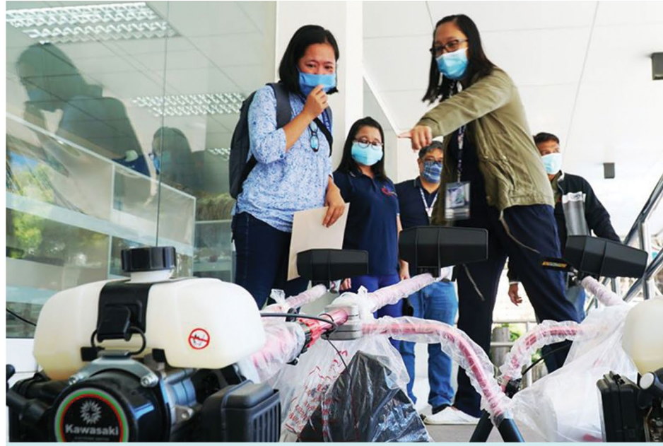
The Provincial Government of La Union turns over to the Local Government Unit (LGU) of Pugo its donation of one glass shredder and one plastic shredder for the LGU's Sanitary Landfill, on July 9, 2020. Likewise, the PGLU turned over the prizes to LGU-winners of the 2018 Provincial Search for the Cleanest, Safest, and Greenest Local Government Unit and Municipal Bodies of Water. Bangar received one plastic shredder while Bauang received three grass cutters as their prizes.