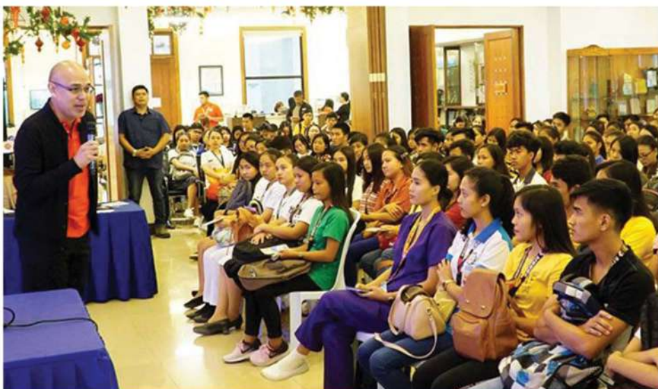
Gov. Pacoy delivers words of encouragement to the Provincial Government of La Union (PGLU) scholars during their annual assembly on December 2, 2019 at the Diego Silang Hall, Provincial Capitol, City of San Fernando, La Union. 859 PGLU scholars were present during the assembly.