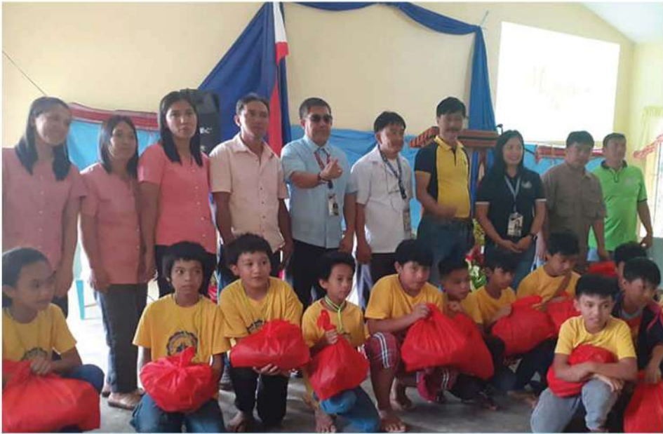
INTERNATIONAL MOUNTAIN DAY CELEBRATION 2019 (BATCH 2). The Provincial Government of La Union, through the Office of the Governor- Environment and Natural ResourcesUnit, celebrates the second batch of International Mountain Day activity by conducting Environmental Awareness Campaign and distribution of Sanitation Kit to 109 pupils of Nayba Elementary School on December 11, 2019 at San Gabriel, La Union in collaboration with the Municipality of San Gabriel and Department of Education. Topic discussed were International Mountain Day; Forest Resources Management; Solid Waste Management; Coastal Resources Management; and Fresh Water Management.

Malaksid iti TOPPS ken PRAISE, agtultuloy a maararamid pay iti Job Orientation, Staff Development, Pre-Retirement, Leadership and Supervisory Development, Technical Skills Development, Mental and Health, ken Values Restoration Programs tapno mapasalun-at dagiti mangmangged ti PGLU.