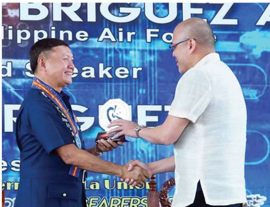
The Provincial Government of La Union through the leadership of Gov. Pacoy, receives a plaque of appreciation from Commanding General LTGEN Rozzano D Briguez AFP of the 580th Aircraft Control and Warning Wing, for its support to their advocacies during their 69th Founding Anniversary on December 13, 2019 held at the Headquarters 580th ACWW, Wallace Air Station, City of San Fernando, La Union.