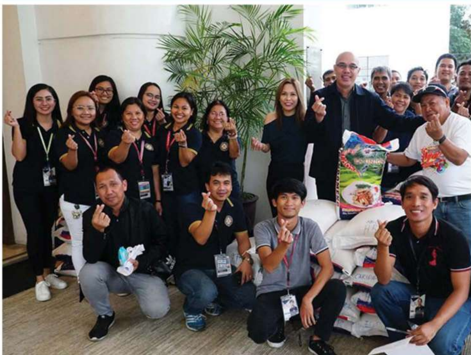
Gov. Pacoy and La Union Vibrant Women, Inc. Chairperson Vini Nola Ortega together with some Provincial Government of La Union (PGLU) employees pose with the "I Love La Union" hand sign during the rice distribution to PGLU employees on December 5, 2019 at the Provincial Capitol, City of San Fernando, La Union.