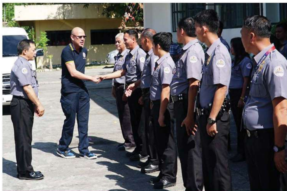
Gov. Pacoy visits the employees of the Provincial Jail on December 23, 2019 at the La Union Provincial Jail, City of San Fernando, La Union. Present to welcome Gov. Pacoy was Provincial Warden Rimas Calixto.