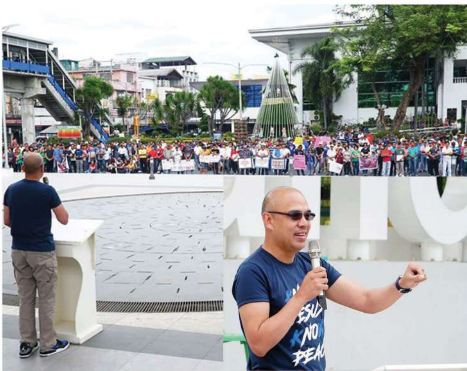
Gov. Pacoy joins the indignation rally against the Communist Party of the Philippines (CPP), the New People's Army and the National Democratic Front on December 26, 2019 in front of City Hall, City of San Fernando, La Union.