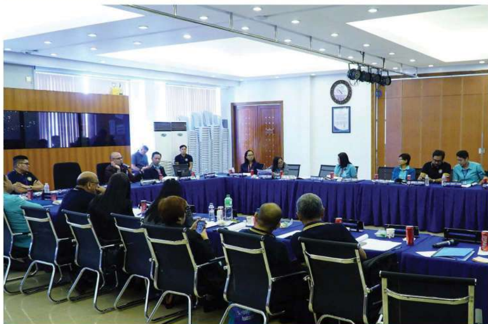
Gov. Pacoy presides the 10th Regular Governor's Cabinet Meeting for the year 2019 on December 2, 2019 at the Diego Silang Hall, City of San Fernando, La Union. Said meeting was attended by different Department and Unit Heads of the Provincial Government of La Union (PGLU) where the Financial Accomplishments of the PGLU was discussed.