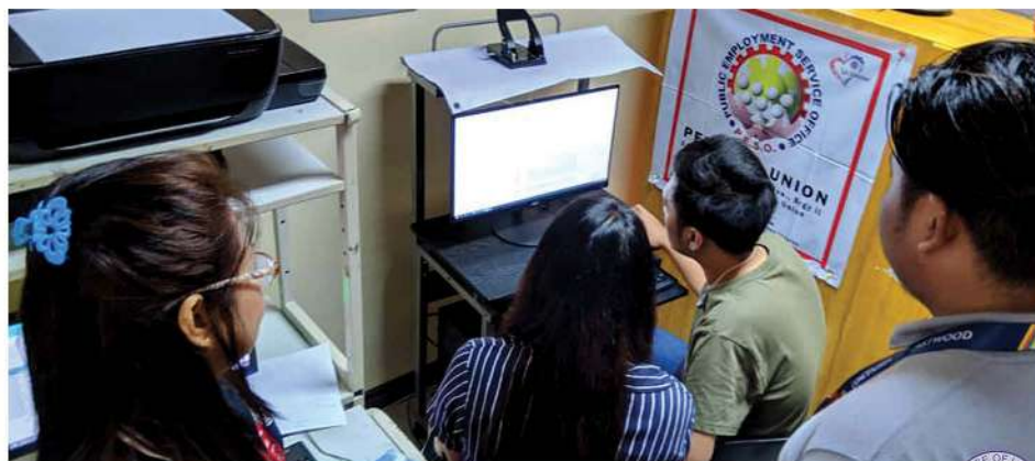
Public Employment and Service Office – La Union Staff and Concentrix representative assist job applicants in the online registration and examination on the second day of the Local Recruitment Activity on October 22-24, 2019 at Second Floor, La Union Provincial Administrative and Commercial Bldg., Quezon Avenue, City of San Fernando, La Union.

Positions offered were Representative, Asset Management, Sales Professional, Sales Support Professional, Administrative Assistant I,