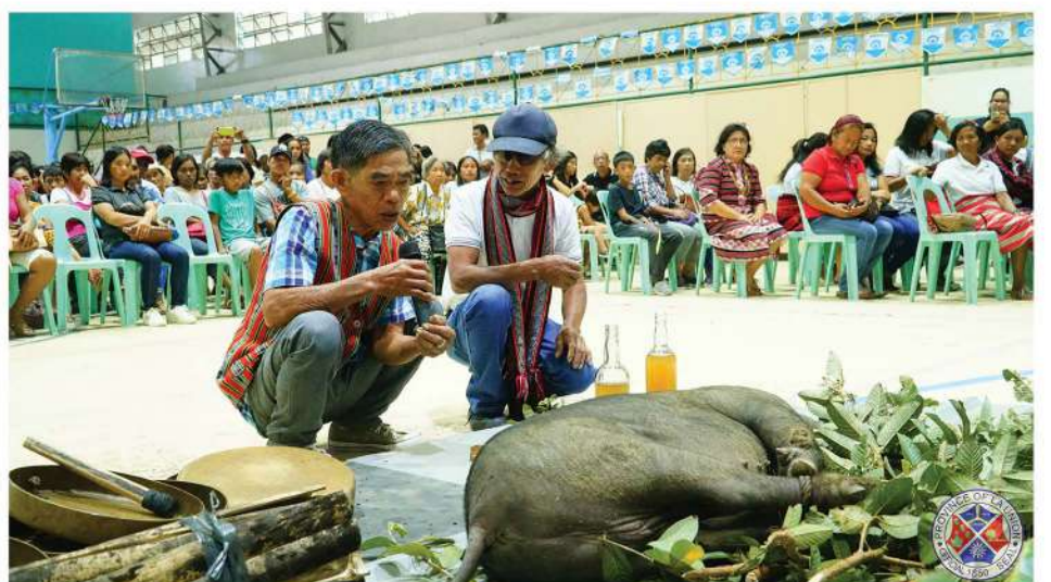
In celebration of the Indigenous Peoples (IP) Month in the Province of La Union, IPs present their cultural dances during the La Union Indigenous Peoples Development Caravan 2019 on October 30, 2019 held at Naguilian Civic Center, Naguilian, La Union.