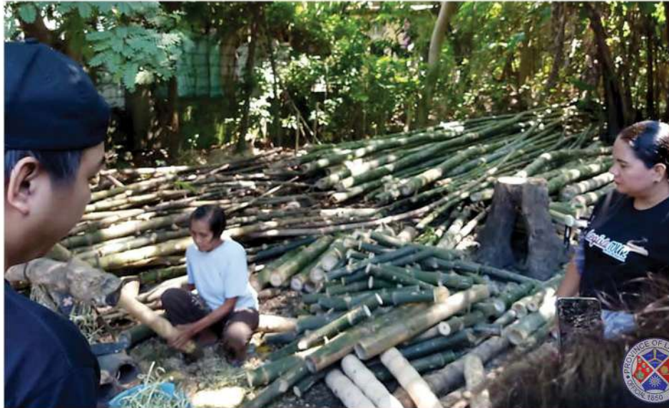
Sangguniang Panlalawigan (SP) secretariat staff observes the process of producing a bamboo craft at Brgy. Gana, Caba, La Union during their SP LegislaTour on October 4, 2019. The SP LegislaTour is an enrolled program of the SP as its direct contribution to the attainment of the provincial strategy to make "La Union the Heart of the Agri-Tourism in Northern Luzon by 2025."

Each employee was required to visit and observe these tourism sites using the principles under the 5As of tourism (Attraction, Accessibility, Accommodation, Amenities, and Activities) and post pictures with appropriate caption in their respective social media accounts to promote and