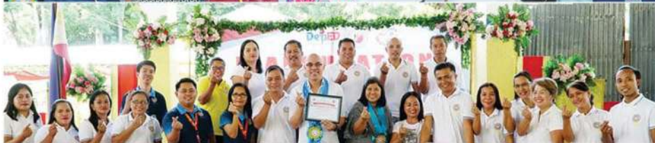
Gov. Pacoy leads the ribbon-cutting ceremony for the inauguration and blessing of the new Multi-Purpose Covered Court of the San Fernando South Central Integrated School on October 18, 2019. In his message, Gov. Pacoy said the new facility reflects the Provincial Government's commitment in fostering excellent educational environment for learners in the province.