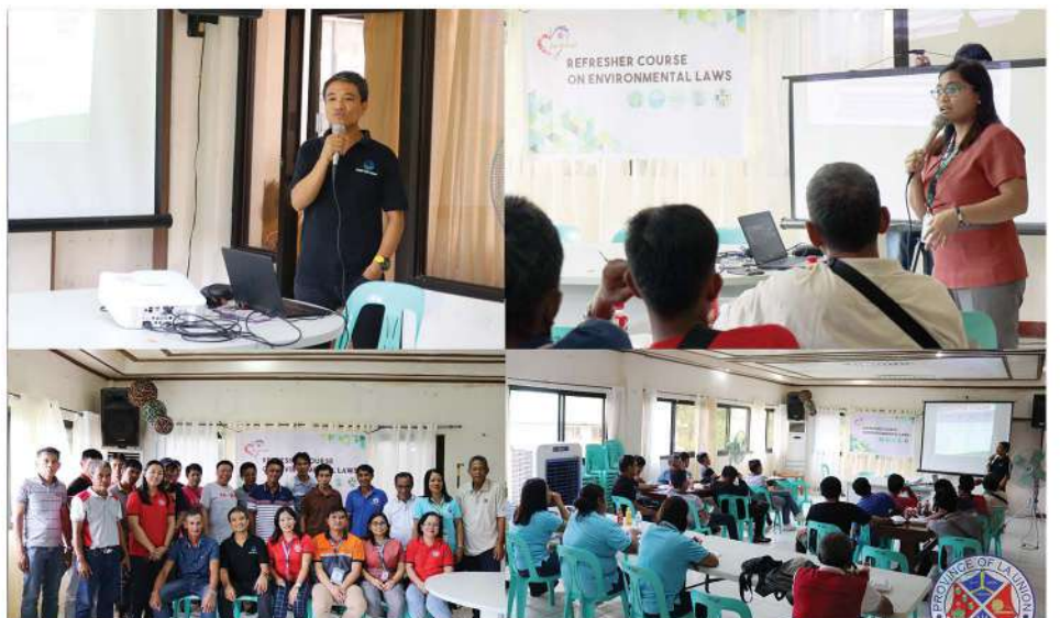
The Provincial Government of La Union through the Office of the Provincial Governor - Environment and Natural Resources Unit (OPG-ENRU) conducts an environmental awareness campaign to the barangay chairpersons of Santol, La Union on October 29, 2019 at the Conference Room, Municipal Hall, Santol, La Union. Lecture series on the different environmental laws were conducted. Representatives from OPG-ENRU, Provincial Environment and Natural Resources Office, and Department of Environment and Natural Resources – Environmental Management Bureau Region 1 were present.