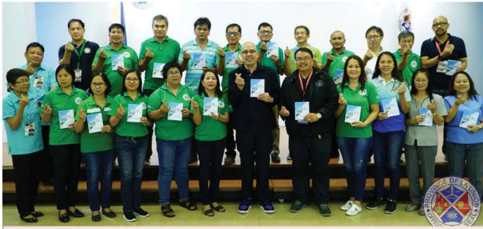
The Provincial Government of La Union through the Office of the Provincial Assessor launches the Assessor's Guidebook presenting the laws and policies on upholding financial stability through sound tax collection and revenue generation on October 21, 2019 at Diego Silang Hall, Provincial Capitol, City of San Fernando, La Union. All 19 Municipal Assessors of LU were present during the event.

The Provincial Government of La Union (PGLU) through the Office of the Provincial Assessor's (OPAss) launched the La Union Assessor's Guidebook on Real Property Tax Assessment at Diego Silang, Capitol Building, City of San Fernando, La Union on October 21, 2019.