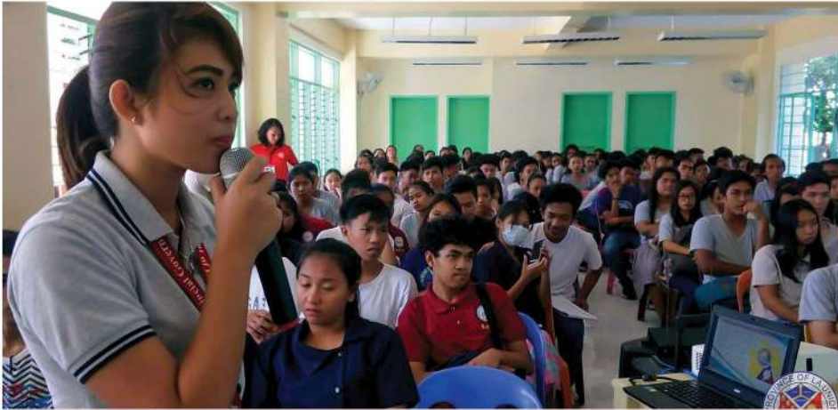
Public Employment Service Office - La Union Staff conducts career guidance to high school students in South Central Integrated School in City of San Fernando, Paringao National High School in Bauang, and Bungol National High School in Balaoan on October 8-10, 2019.

The Provincial Government of La Union (PGLU) through its Public Employment Service Office (PESO) conducted a career symposium in three schools in La Union on October 8 – 11, 2019.