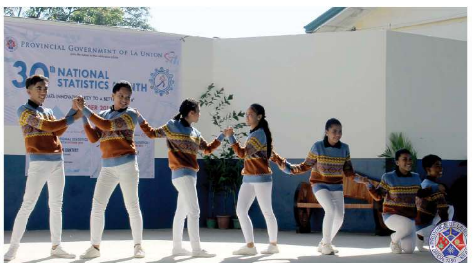
JINGLE MAKING AND SINGING CONTEST. Performers of Don Eulogio De Guzman Memorial National High School give their winning performance in the Jingle Making and Singing Contest for the Secondary Level during the Provincial Celebration of 30th National Statistics Month (NSM) on October 7, 2019 at Catbangan Central School, City of San Fernando, La Union. The group also emerged as champion in the NSM Regional Jingle Singing Contest held at the Bangko Sentral ng Pilipinas, City of San Fernando, La Union on October 8, 2019.