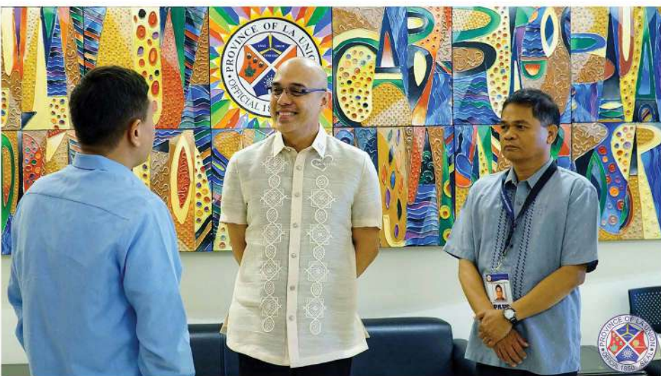
Gov. Pacoy meets with representatives from the National Security Council and the Department of the Interior and Local Government La Union Provincial Office led by Dir. Paulino Lalata, Jr. during a courtesy call on October 8, 2019 at the Office of the Governor, Provincial Capitol, City of San Fernando, La Union. They discussed the thrusts of La Union in supporting the nation's campaign to end local communist armed conflict.