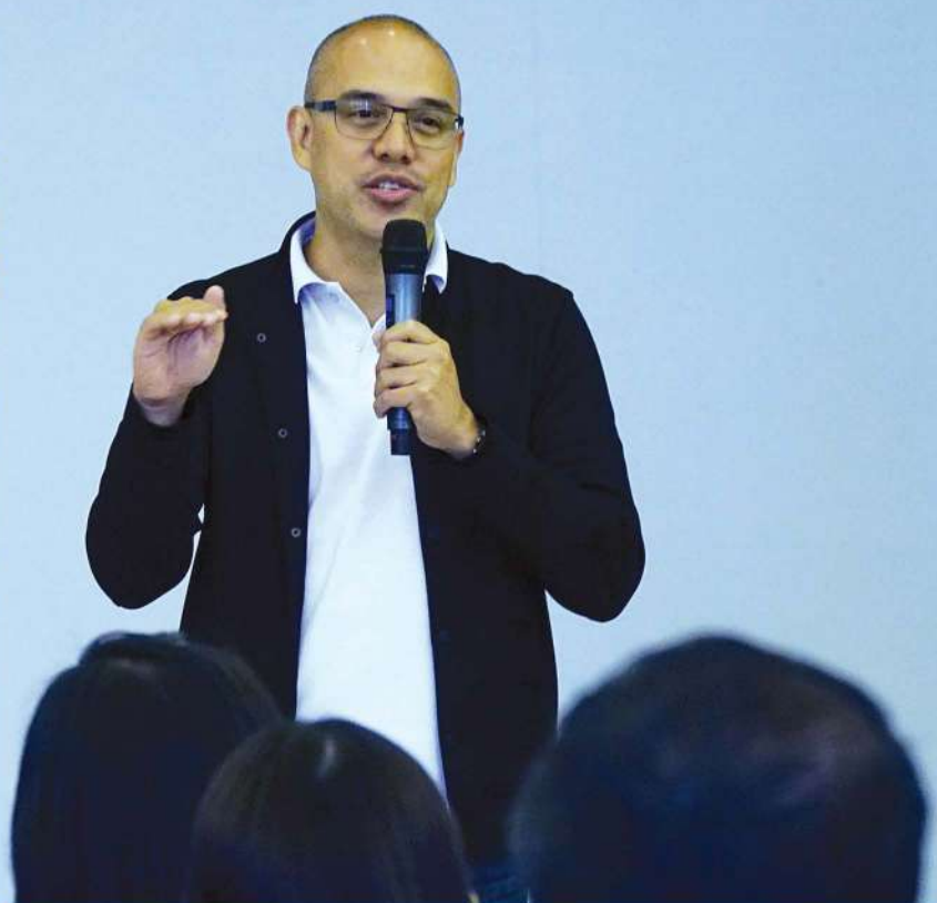
Gov. Pacoy shares his experiences in the implementation of the Performance Governance System (PGS) in the Provincial Government of La Union during the Exit Conference of the Third Party Audit for the Proficiency Stage of PGS at the Diego Silang Hall, Provincial Capitol, City of San Fernando, La Union on September 27, 2019. Results of the audit is expected to be released on October 21, 2019.