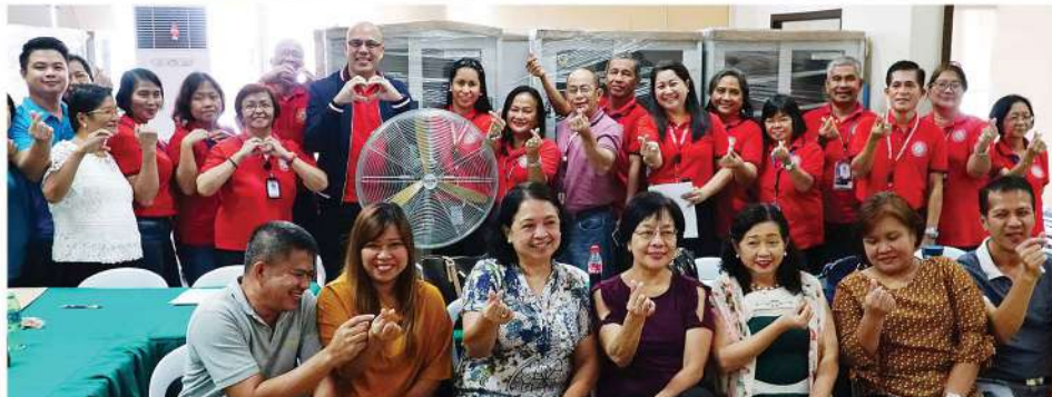
Gov. Pacoy leads the ceremonial turnover of steel cabinets and industrial fans to Rural Health Units and District Hospitals during the Joint Oversight Committee Meeting of Public Health and Public Hospitals held at the old Provincial Health Office (PHO), Provincial Capitol, City of San Fernando, La Union on September 17, 2019. These logistics were given by the Department of Health as requested by Dr. Rodolfo Tongson, PHO I for the National Tuberculosis Control Program.