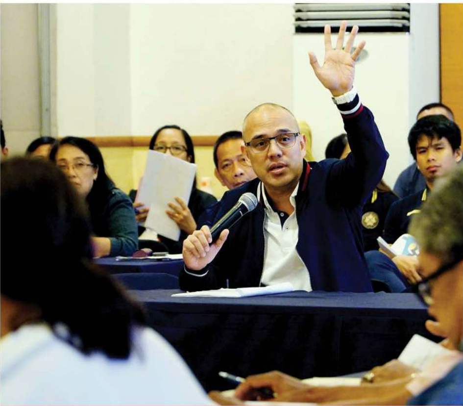
Gov. Pacoy presides over the Provincial Development Council (PDC) meeting being the PDC Chairperson on September 26, 2019 at Hotel Ariana, Paringao, Bauang, La Union. Highlight of the meeting was the presentation of the new composition of the council.

University of the Philippines Los Baños presented the Climate Change-Responsive Integrated River Basin Management and Development Master Plan (IRBMDMP) for the Cluster 1 River Basin (Amburayan, Baroro and Bauang). The said project aimed to formulate an IRBMDMP for the eight clustered river basins. The IRBMDMP has three phases: Phase I is the midterm report comprising the ecological profiling of the watershed, report on climate vulnerability assessment and IRBMD strategy; Phase II is the draft master plan report; and Phase III is the final report duly accepted by the Regional Development Council (RDC). Recognizing the advantages and benefits of the project to local communities in La Union, the body approved the proposed Development Master Plan for adoption.