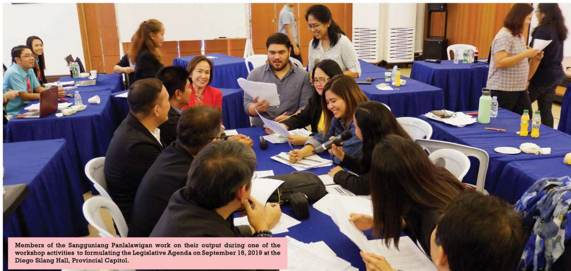
Members of the Sangguniang Panlalawigan work on their output during one of the workshop activities to formulating the Legislative Agenda on September 16, 2019 at the Diego Silang Hall, Provincial Capitol.