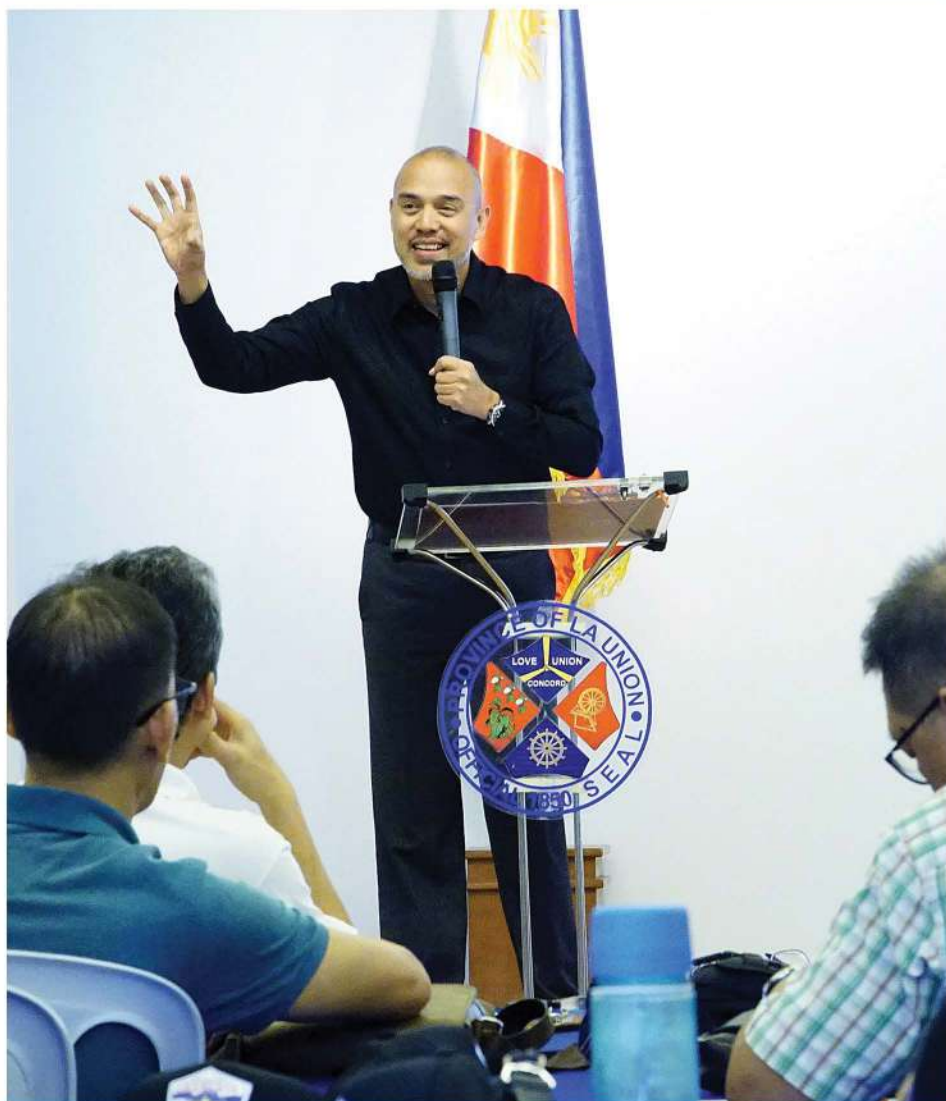
Gov. Pacoy addresses the heads of the various Civil Society Organizations (CSOs) in La Union during their meeting on September 13, 2019 at the Diego Silang Hall, Provincial Capitol, City of San Fernando, La Union. The meeting aimed to organize the CSOs for its representation at the province's Local Special Bodies.