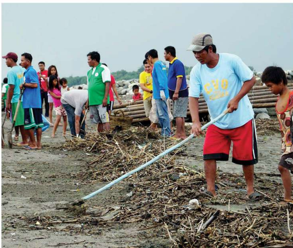
Over 300 participants jointly collect tons of waste during the coastal clean-up activity led by the Office of the Provincial Governor -Environment and Natural Resources Unit in Barangay Alaska, Aringay, La Union on September 21, 2019. Said event was in celebration of the International Coastal Clean Up which is being celebrated worldwide every 3rd Saturday of September by virtue of Presidential Proclamation No. 470, S. 2003.

According to the United Nations, the Day of Families "provides an opportunity to promote awareness of issues relating to families and to increase knowledge of the social, economic and demographic processes affecting them." National Family Day is celebrated annually every September 26.