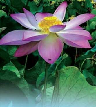
LOTUS VALLEY FARM

Tagged as the new economic game-changer, Agri-Tourism is one of the drivers for economic development. The word "Agri-Tourism" is coined from words agriculture and tourism. Primarily, Agri-Tourism involves an agriculturally-based operation or activity that draws visitors to a farm, ranch or any natural site like vegetable plantations, orchid farms and bee farms for outdoor recreational activities, education, shopping or even lodging.