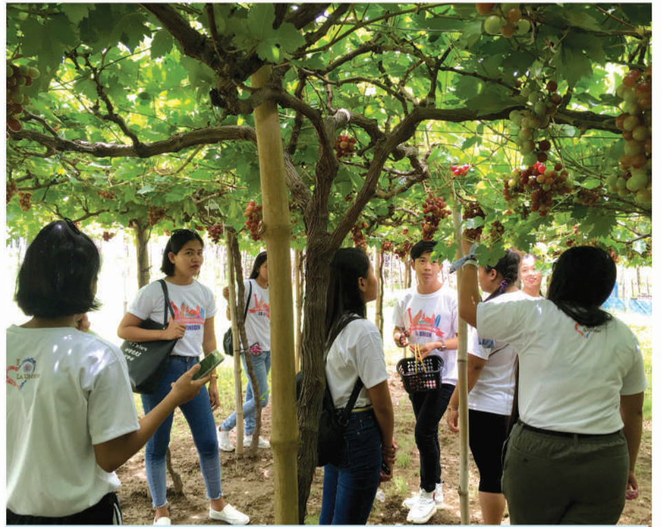
The Provincial Government of La Union through the Provincial Information Office – Tourism Operations Unit conducts a guided familiarization tour dubbed as "Tour Your Own Province" on June 13-14, 2019 in the different tourist destinations of La Union. Tourism and Hospitality Management students from various colleges and university in the province participated in the said activity which aimed to introduce and expose students to different tourism products and services of the province.