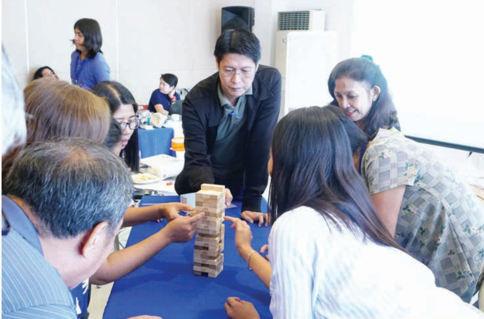
Middle Management Heads of the Provincial Government of La Union (PGLU) participate in the leadership and competency development activities of the Management Development Series at Hotel Ariana, Paringao, Bauang, La Union on June 20-21, 2019. Same activity was participated in by PGLU Top Management Heads on June 18-19, 2019 in the same venue.