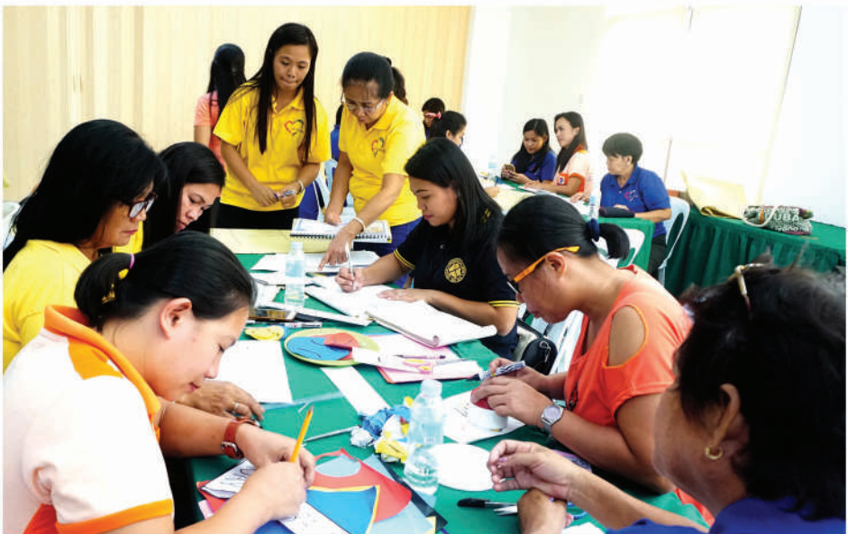
76 daycare workers from the Municipalities of Bagulin, Burgos, Tubao, Pugo and Santol; Provincial Government of La Union; and La Union Police Provincial Office participate in the Capability Training on the National Early Learning Curriculum and the New Early Childhood Care and Development Accreditation Standards conducted by the Provincial Social Welfare and Development Office on June 19-21, 2019 at the La Union Technology and Livelihood Development Center, Guerrero Road, City of San Fernando, La Union.