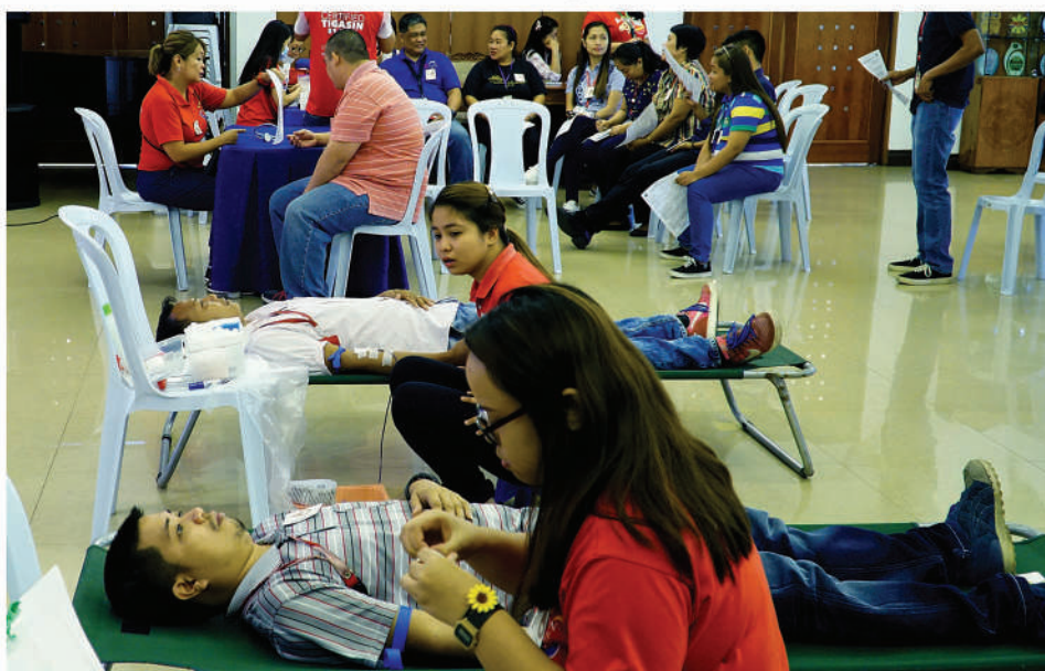
WORLD BLOOD DONOR DAY. The Provincial Government of La Union, headed by Gov. Francisco Emmanuel "Pacoy" R. Ortega III, joins the celebration of World Blood Donor Day through a Mobile Blood Donation spearheaded by the Provincial Health Office and La Union Medical Center on June 14, 2019 at the Diego Silang Hall, Provincial Capitol, City of San Fernando, La Union. A total 26 units of blood were collected in said activity.

Prior to the activity, the Gov. Francisco Emmanuel "Pacoy" R. Ortega III requested the respective offices to submit names of interested potential