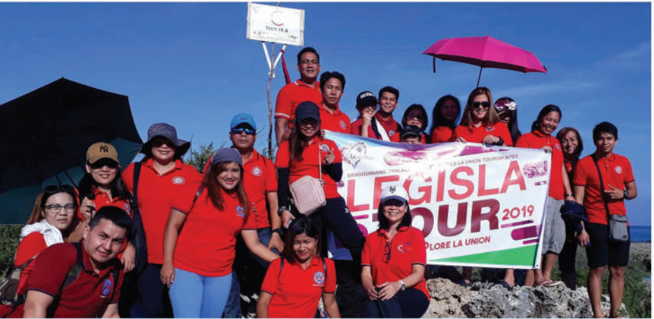
Sangguniang Panlalawigan (SP) Staff explores the Sea Urchin Sanctuary at Balaoan, La Union during the SP LegislaTour on May 24, 2019. The activity was conducted to support the Medium-Term Provincial Strategy which aims to position La Union as the Preferred Tourist Destination in Northern Luzon by 2022.

Aside from site seeing, the SP employees were also made to assess the