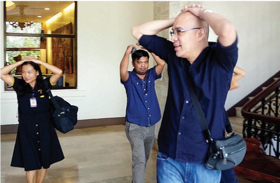
DUCK. COVER. HOLD. With the aim to strengthen their disaster preparedness, Provincial Government of La Union employees led by Gov. Pacoy employ the "duck, cover, and hold" technique as they participate in the National Simultaneous Earthquake Drill 2019 on June 20, 2019 at the Provincial Capitol, City of San Fernando, La Union.