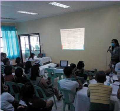
02 DISTRICT HOSPITALS CONDUCT ISO QUALITY MANAGEMENT SYSTEM AUDIT