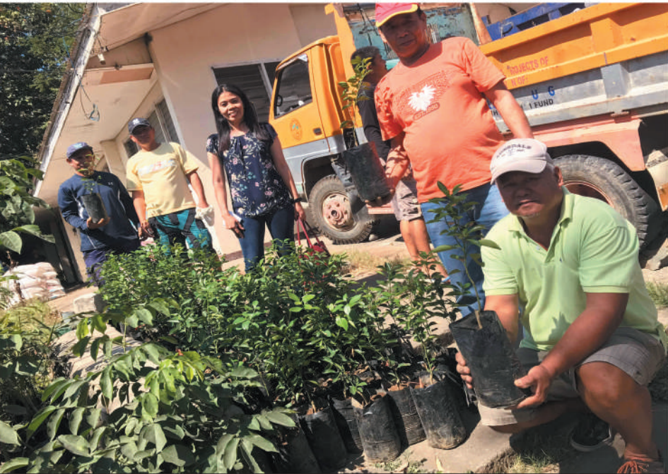
The Provincial Government of La Union, in coordination with the Department of Agriculture – Regional Field Office 1 (DA-RFO1), distributes Hybrid Rice Seeds, High Quality Seeds (HQS) and Soil Ameliorants to municipalities with partially damaged rice areas during the onslaught of Typhoon Ompong as a part of the rehabilitation program on January 21, 2019. Cacao and calamansi seedlings are also released allocations from the High Value Crops Development Program.