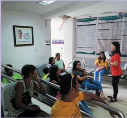
07 CDH CONDUCTS INFORMATION EDUCATION DRIVE AMONG OPD & INPATIENTS