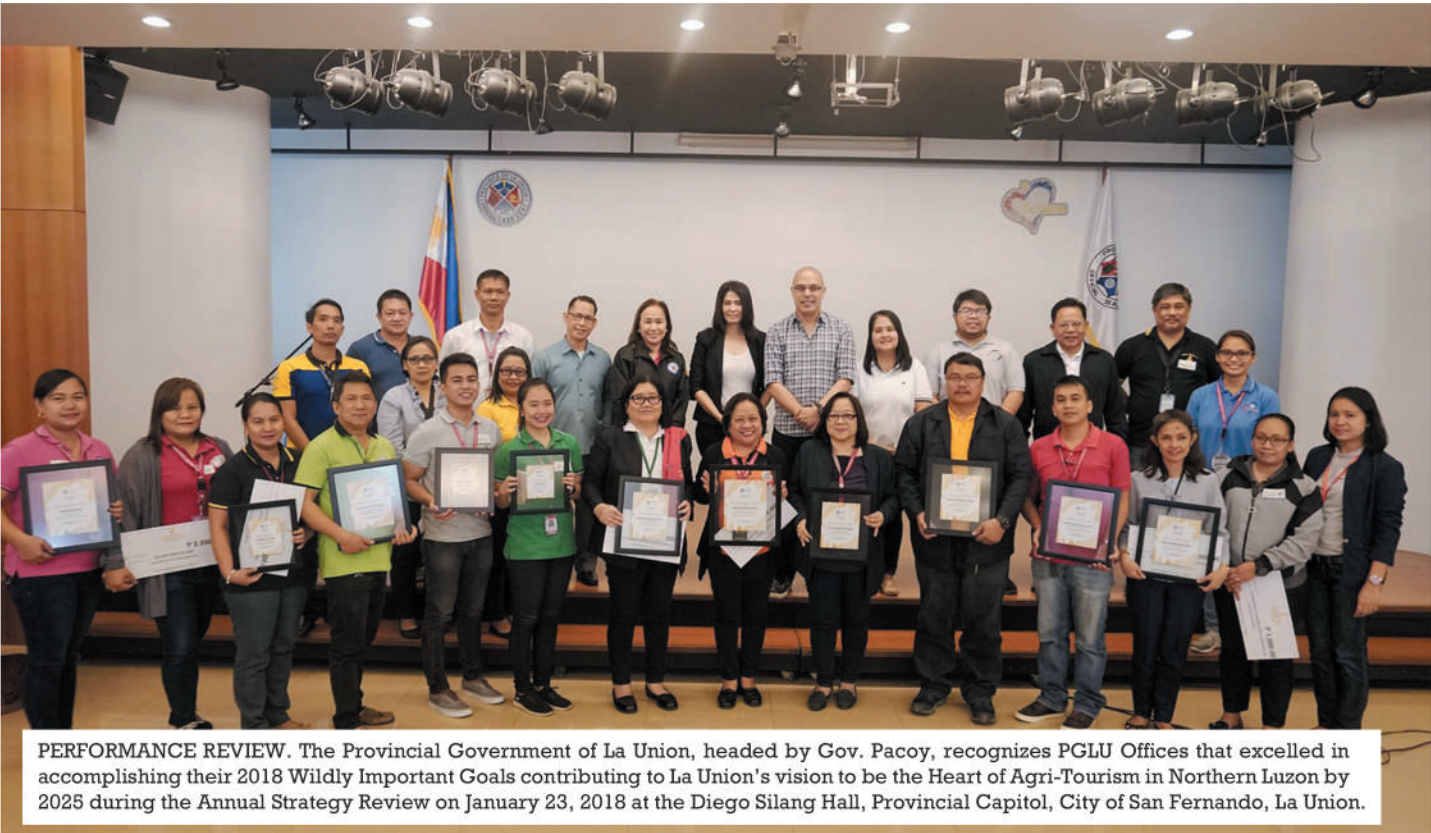
PERFORMANCE REVIEW. The Provincial Government of La Union, headed by Gov. Pacoy, recognizes PGLU Offices that excelled in accomplishing their 2018 Wildly Important Goals contributing to La Union’s vision to be the Heart of Agri-Tourism in Northern Luzon by 2025 during the Annual Strategy Review on January 23, 2018 at the Diego Silang Hall, Provincial Capitol, City of San Fernando, La Union.

The Provincial Government of La Union (PGLU) through the Office for Provincial Strategy (OPS) spearheaded the conduct of the 2019 Strategy Review (Power Up, Raise Your Game) on January 23, 2019 at the Diego Silang Hall, Provincial Capitol, City of San Fernando, La Union. The event, which is one of the elements of the Performance Governance System (PGS), was participated in by PGLU department heads and key office personnel who had been working hands on for the past two years towards the attainment of the province’s vision to make La Union as the Heart of Agri-Tourism in Northern Luzon by 2025. It served as an avenue to monitor, evaluate and report the status if the strategy is contributory to the fulfilment of vision. In his speech, Gov. Francisco Emmanuel “Pacoy” R. Ortega III emphasized the importance of the vision in order to have direction. He also encouraged everyone to continuously work together to achieve more. “Today means it is high time for us to be in a level