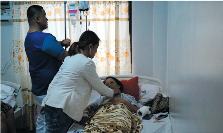
SHARED BLOOD. SAVED LIFE. A patient who is a resident of Luna, La Union receives blood through transfusion during her admission at Bacnotan District Hospital (BDH). She is one of the recipients of the blood units collected during the 11th Mass Blood Donation Activity in partnership with the Philippine Red Cross – La Union – San Fernando City Chapter on January 27, 2019 at BDH. To augment the shortage of blood and blood products, BDH personnel, their friends, and partner agencies voluntarily donated their blood during the activity. Relatives of the patients also donated their blood.