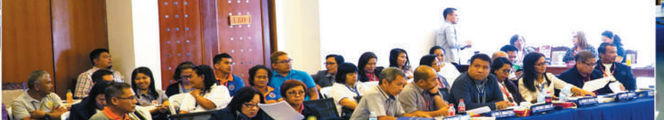
Gov. Pacoy recaps the 2018 performance of the Provincial Government of La Union and encourages all Department Heads and Chiefs of Hospitals to work together in providing better services to the people during the Cabinet Meeting on January 7, 2019 at the Diego Silang Hall, City of San Fernando, La Union.