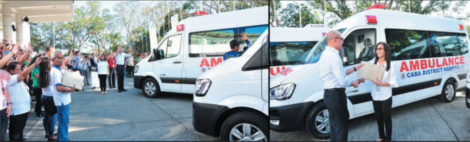
To further reinforce the preparedness of the five district hospitals in La Union, Gov. Pacoy turns over an ambulance for each hospital on January 7, 2019 at the Provincial Capitol, City of San Fernando, La Union. Recipients of the ambulances were Rosario, Caba, Naguilian, Bacnotan and Balaoan District Hospitals. Another ambulance for the La Union Medical Center is expected to be turned over before the end of the month.