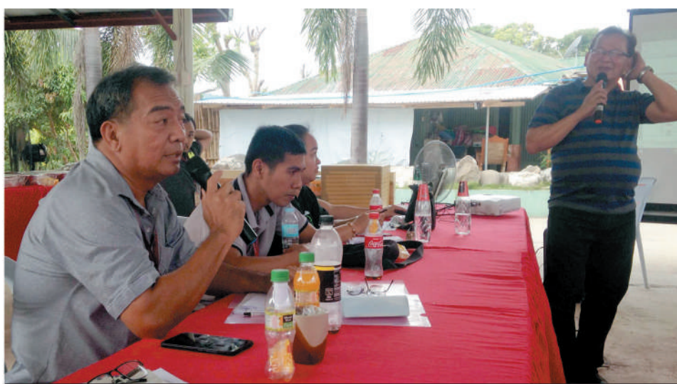
The employees of the Provincial Planning and Development Office (PPDO) conduct their CY 2019 Work Planning Session on January 18, 2019 at the Fritz Resort, Santol, La Union. Among the objectives of said activity were the discussion of the office's CY 2019 Annual Work and Financial Plans and work assignments; strengthening the alignment of all programs, projects, and activities (PPAs) of PPDO down to the Unit and Individual level; and the facilitation of the monitoring of the programmed PPAs and budget of the PPDO for CY 2019.