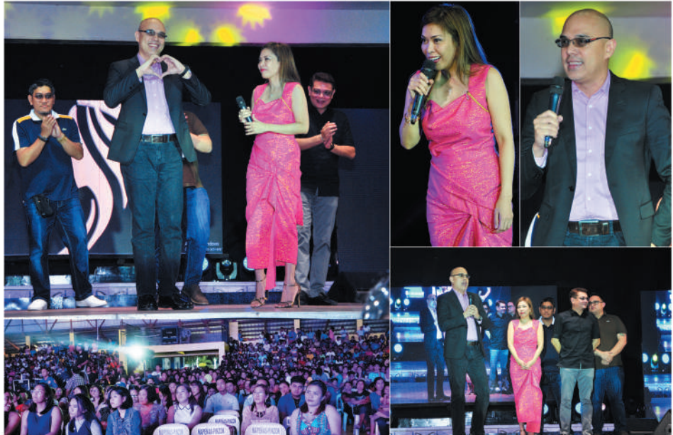
Gov. Pacoy and ABONO Party-List Representative Vini Nola A. Ortega commend the Municipality of Bangar for their consistent promotion of their Inabel products during the Coronation Night of Mutia Ti Abel-Bangar 2019 at Bangar, La Union Municipal Gymnasium on January 2, 2019.