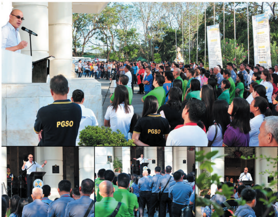
NEW BEGINNING. Gov. Francisco Emmanuel "Pacoy" R. Ortega III highlights the achievements of the Provincial Government of La Union for 2018 and enjoins all employees to further work together to achieve more in 2019 during the First Monday Flag Raising Ceremony on January 7, 2019 at the Provincial Capitol Grounds, City of San Fernando, La Union.