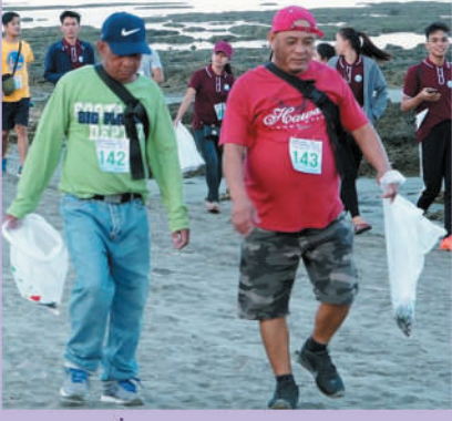
08 PAGNA PAGNA PARA ITI BASURA