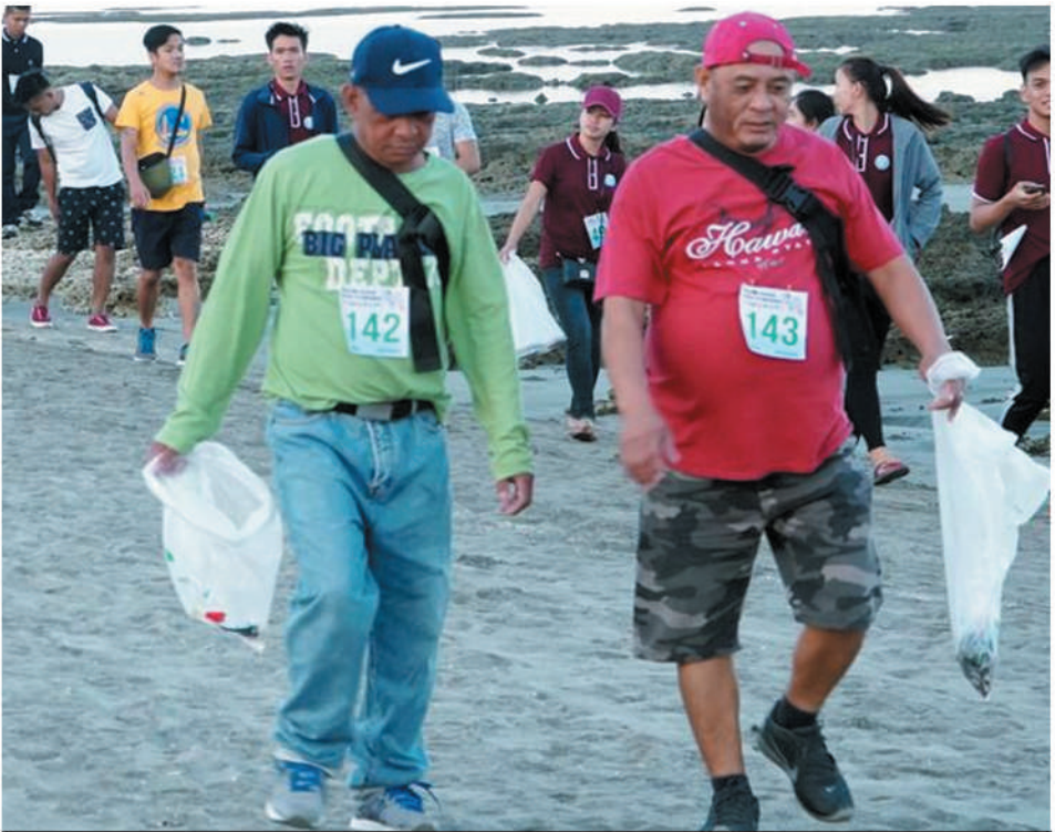
The Provincial Government of La Union joins the celebration of the National Zero Waste Month through a beach fun walk activity cum coastal clean-up drive dubbed as "Pagna Pagna para iti Basura" on January 26, 2019 along the shorelines of the City of San Fernando to the Municipality of San Juan. Over 700 participants joined where around three cubic meters of trash were collected and disposed in the sanitary landfill of the City of San Fernando.

Through Presidential Proclamation No. 760 dated May 5, 2014, every month of January was declared as National Zero Waste Month. This serves as reminder to be mindful of waste produced.