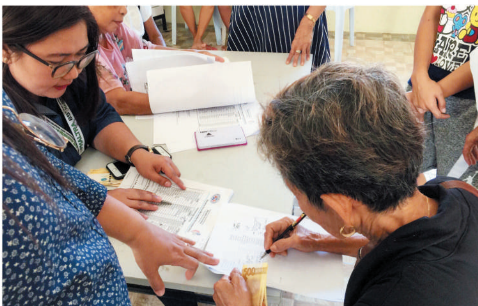
The Provincial Government of La Union, through the Provincial Treasurer's Office and Provincial Social Welfare and Development Office, distributes Food Subsistence to Senior Citizens and Persons with Disabilities (PWD) of Municipality of Luna at the PWD Building, Luna, La Union on January 4, 2019.