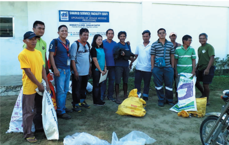
The Office of the Provincial Veterinarian, in coordination with the Department of Agriculture Regional Field Office 1, distributes 52 native swine to 26 animal raisers affected by Typhoon Ompong in the Municipalities of Agoo, Aringay, Burgos, Naguilian, Pugo, Tubao and City of San Fernando on January 18, 2019 as part of the Rehabilitation and Recovery Plan. The animals were also given multivitamins and antibiotics during the distribution.