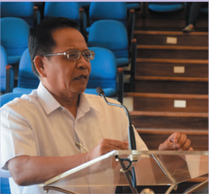
08 CREATION OF SP LEGISLATIVE BACKSTOPPING COMMITTEE APPROVED