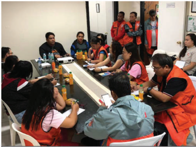
The Rapid Damage Assessment and Needs Analysis (RDNA) Team convene before deployment to various evacuation centers in La Union on September 15, 2018 at the Provincial Disaster Risk Reduction and Management Office (PDRMO) Operations Center. Said teams were divided into three groups tasked to determine the extent of damage and needs requirements in the Northern, Central and Southern parts of La Union.

With said declaration, the PGLU was able to use the emergency fund in providing relief assistance to the affected residents. Prices of basic commodities were also automatically frozen at their prevailing prices.