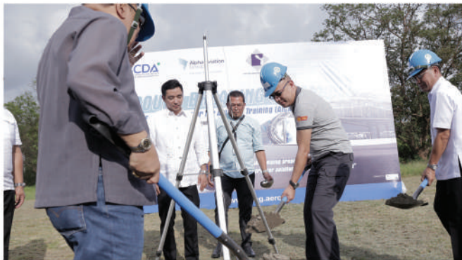
AVIATION IN LA UNION. Gov. Pacoy leads the groundbreaking of the site for the construction of the hangar by the Alpha Aviation Group (AAG) International Center for Aviation Training at the San Fernando Airport Compound, Brgy. Canaoay, City of San Fernando, La Union on September 26, 2018. With the construction of the hangar, La Union aims to become the premier aviation training hub in the region.