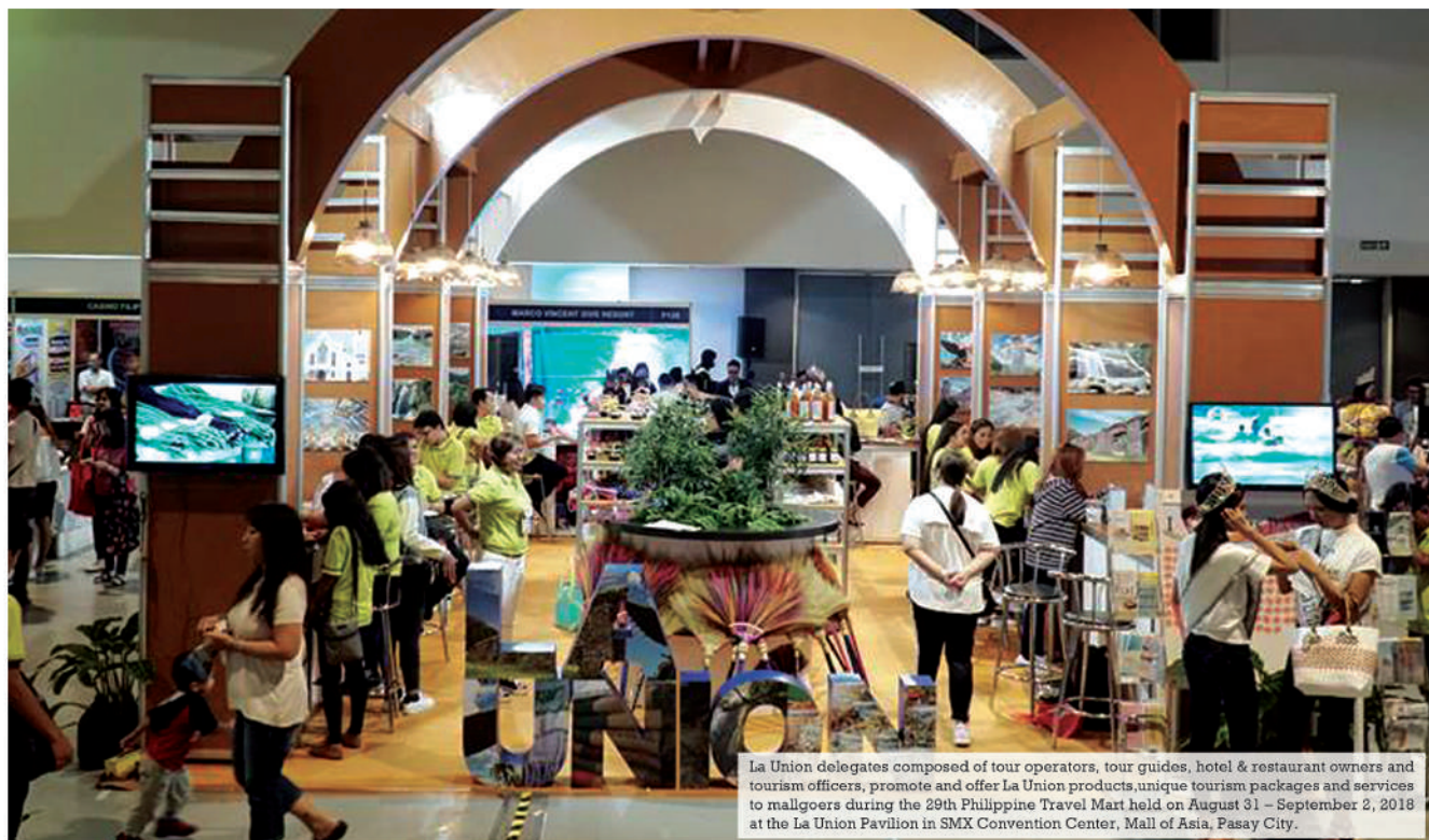
La Union delegates composed of tour operators, tour guides, hotel & restaurant owners and tourism officers, promote and offer La Union products, unique tourism packages and services to mallgoers during the 29th Philippine Travel Mart held on August 31 – September 2, 2018 at the La Union Pavilion in SMX Convention Center, Mall of Asia, Pasay City.