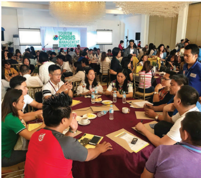
La Union Tourism Officers formulate their crisis management plan during the Regional Tourism Crisis Management Symposium conducted by the Department of Tourism - Region 1 on September 19, 2018 at the Agora Events Center, Thunderbird Resorts, Poro Point, City of San Fernando, La Union. The symposium highlighted the promotion of the stability of the tourism industry in times of adversity.

With the aim to strengthen tourism resiliency, the Provincial Government of La Union (PGLU) participated in the first Regional Tourism Crisis Management Symposium conducted by the Department of Tourism (DOT) Region 1 on September 19, 2018 at the Agora Events Center, Thunderbird Resorts, Poro Point, City of San Fernando La Union.