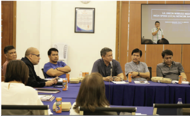
Gov. Pacoy and the mayors of Component Local Government Units in La Union intently listen to the presentation on the La Union Wireless Mesh High Speed Local Network Backbone on September 7, 2018 at the Diego Silang Hall, Provincial Capitol, City of San Fernando, La Union. The project aims to establish high-speed wireless mesh infrastructure that cuts across the province.