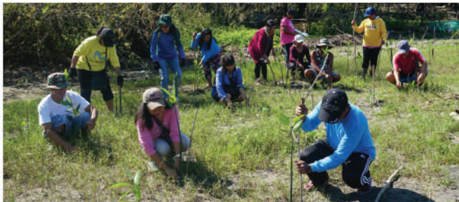
The Office of the Provincial Agriculturist (OPAg) - Fishery Services Unit conducts a Mangrove Planting and Coastal Clean-up at Barangay Pandan, Bacnotan, La Union on September 18, 2018. Barangay Officials and the municipality's Fisheries and Aquatic Resources Management Council members also participated in the activities to protect shorelines from damages brought by storm winds, waves, and floods.