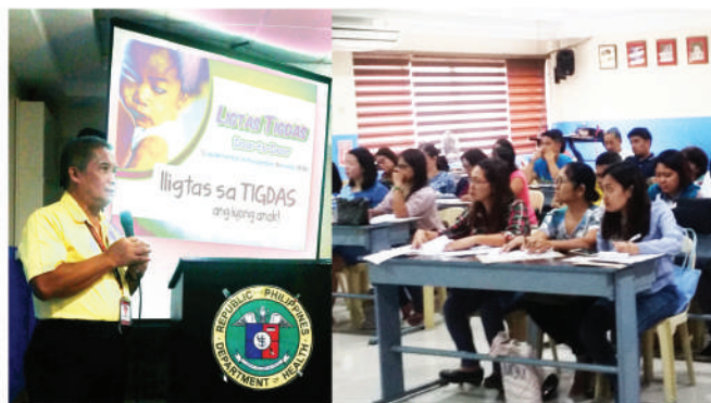
National Immunization Program Managers from the Rural Health Units, City Health and Wellness Clinic, and La Union District Hospitals attend the Ligtas Tigdas Supplemental Immunization Activity (LTSIA) Orientation conducted by the Provincial Health Office in coordination with the Department of Health Regional Office I (DOH-ROI) held at the DOH Conference Room, City of San Fernando, La Union on September 7, 2018. The campaign aims to address pockets of measles outbreaks in the province.

The ordinance awaits its publication and copy furnished to appropriate authorities and Local Government Units before its full implementation.