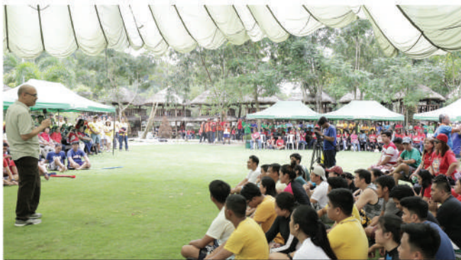
ONE TEAM, ONE FAMILY. Gov. Pacoy talks about the importance of connection among all Provincial Government of La Union (PGLU) employees in his message during the PGLU Family Day 2018 at Pugad, Pugo, La Union on September 28, 2018.

Activities for the PGLU Family Day 2018 started with a Zumba which was