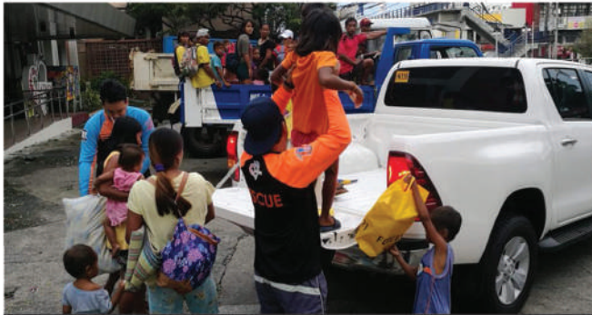
Responders from the La Union Rescue send-off the evacuees in the morning of September 16, 2018 after the End of Danger Siren rang, which marks that La Union is already free from risks brought by Typhoon Ompong