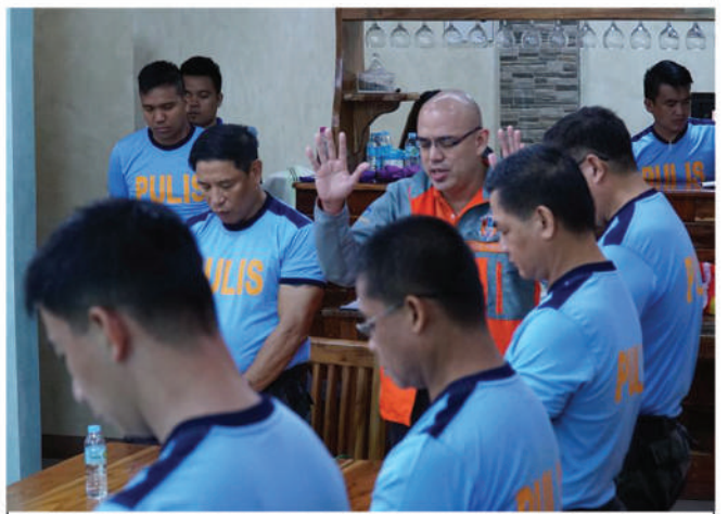
PRAYER AND ACTION. Gov. Pacoy prays for the safety of the police officers who will render services to ensure public safety in relation to the onset of typhoon "Ompong," during his visit to the Philippine National Police Regional Office 1, City of San Fernando, La Union on September 14, 2018.