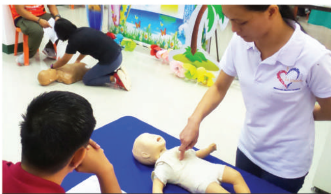
Personnel of Bacnotan District Hospital (BDH) demonstrate their skills in Cardiopulmonary Resuscitation (CPR) on a dummy infant during the Basic Life Support (BLS) Training on September 6, 2018 at the said hospital. Such training is regularly conducted among hospital personnel to refresh their life-saving expertise in times of emergencies and in return impart these to people in the community as part of the strategic project of the hospital, "Provision of First Aid and Basic Life Support (BLS) Training to residents of the Central Agri-Tourism Circuit."

Such BLS training for healthcare providers is regularly conducted among hospital personnel to refresh their life-saving expertise in times of emergencies. In return, they will impart these to people in the community as part of the strategic project of the hospital, "Provision of First Aid and Basic Life