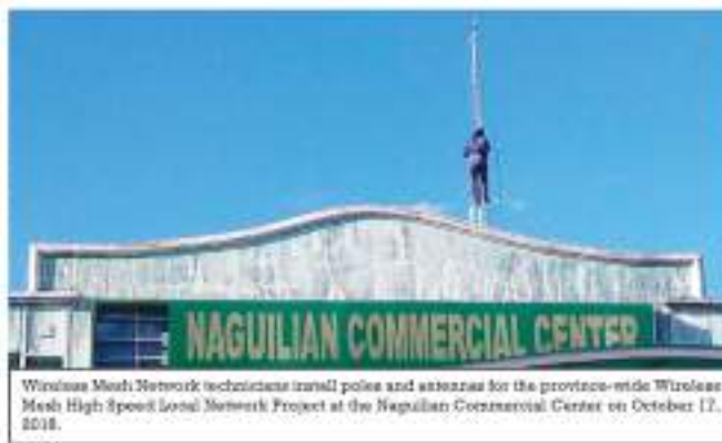
Wireless Mesh Network technicians install poles and antennas for the province-wide Wireless Mesh High Speed Local Network Project at the Naguilan Commercial Center on October 17, 2018.

Through the establishment of the WMN the province can have a devoted wireless network that it fully owns and controls. It will provide a dynamic private