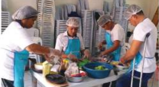
Differently abled persons participate in the deboning of nilfish which is one of the activities of the Pederasyon ng May Kapansanan ng La Union's skills competition ABLYMPICS on October 6, 2018 at the Provincial Social Welfare and Development Office (PSWDO), City of San Fernando, La Union. The competition was spearheaded by the PSWDO and includes food preparation, cooking, flower arrangement, chess, scrabble and waste re-use.