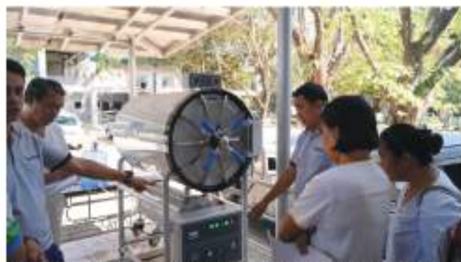
NEW HOSPITAL EQUIPMENT. Bacnotas District Hospital (BDH) Operating Room Staff learn carefully to the demonstration on the use of a 1000-liter capacity associate equipment for ventilation. The new equipment, which was received by the hospital on October 8, 2018, is part of Gov. Faeys's initiatives to modernize the province's district hospitals in line with the province's transformative governance on health.