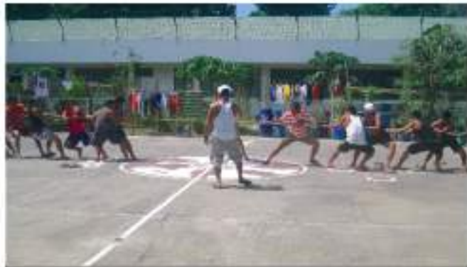
La Union Provincial Jail conducts different sports activities and talent search to uplift the Persons Deprived of Liberty during the celebration of 2018 National Correctional Consciousness Week from October 22-26, 2018, La Union Provincial Jail, Pias, City of San Fernando, La Union.

With the theme "Pagbabago sa Kanlangan ug Pistas ay Tunay na Makabansan sa Makabagong Pansamayan," the LUPJ in coordination with partner agencies and inmates, conducted various activities which included the provision of spiritual and guidance counseling, poster making contest, pañon games, and sportsmanship