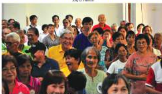
SWEET LIFE. The Senior Citizens of La Union enjoying the old music entertainment and dance exercise during the Provincial Elderly Week celebration with a theme, "Kilalanin a Parangalan: Yaga Salong Ng Kapapatan Ng Nakatatanda Tungo Sa Lipnang Makapaghalang" held on October 8, 2018 at the La Union Technology and Livelihood Development Center, Guerrero Road, City of San Fernando, La Union.