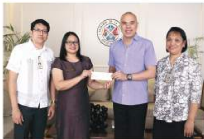
On behalf of the Provincial Government of La Union, Gov. Francisco Emmanuel "Paco" E. Ortega III accepts a check from the Land Bank of the Philippines on October 18, 2018 at the Office of the Provincial Governor, Capitol building, City of San Fernando, La Union. The fund will be utilized to cover the expenses used for the restoration of the province from the damages brought about by Typhoon Ondoy on September 14-15, 2018.