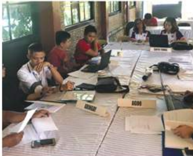
Participants from the Southern Circuit discuss and prepare their inputs during the Extended Local Tourism Development Planning Workshop conducted on October 16, 2018 at the Agoo Swimmers World Resort and Hotel, Agoo, La Union.

Throughout the activity, participants underwent mini-workshops on using the LTDP templates. The participants were given the chance to present to the body their workshop outputs which were critiqued by the evaluators from the DOT-RO1, Provincial Planning and Development Office, Provincial Tourism Office and Provincial Agriculture. They were also provided inputs on how to improve their tourism plans. Areas of