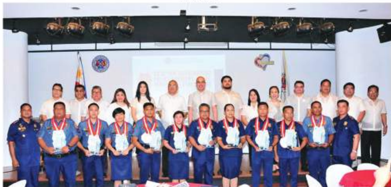
The Provincial Government of La Union (PGLU), headed by Gov. Pacoy, confers 10 Outstanding Police Officers in the Province of La Union for 2018 on October 11, 2018 at the Diego Silang Hall, Provincial Capitol, City of San Fernando, La Union. Each awardee was given a Plaque of Recognition and P10,000.00 as cash incentives from the PGLU.

The Provincial Government of La Union (PGLU), through Sangguniang Panlalawigan Resolution No. 539-2018, conferred the Ten Outstanding Police Officers in the Province of La Union (TOPPEU) for 2018 on October 11, 2018 at the Diego Silang Hall, Provincial Capitol, City of San Fernando, La Union.