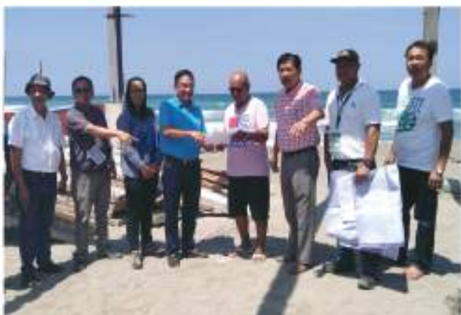
Concerned agencies composed of Department of Environment and Natural Resources, Mines and Geosciences Bureau, Provincial Government of La Union, and the Local Government Unit of San Juan, La Union meet on October 3, 2018 to discuss the ongoing construction along the shoreline of San Juan, which was seen to pose a threat to the sea turtles' nesting area. As a result of the meeting, the team issued a temporary stoppage of construction activity while waiting for the result of coastal assessment.