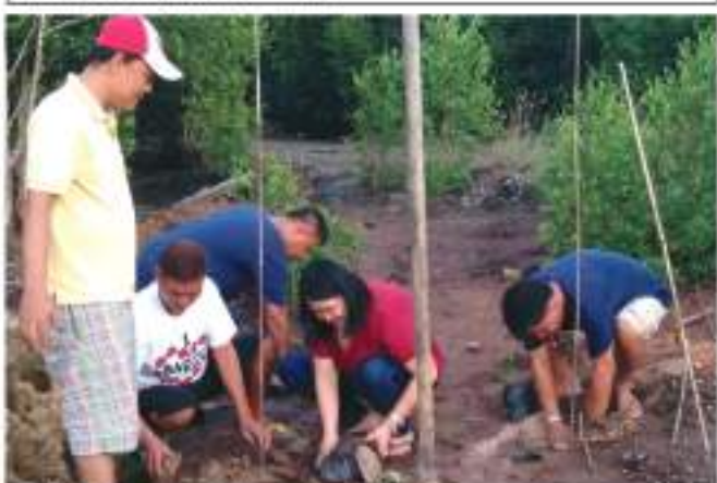
La Union Sangguniang Pambalayan Members (SPMs) participate in mangrove planting during their on-site visit at the mangrove nursery and mangrove plantation of Puerto Princesa City, Palawan on October 14, 2018. The SPMs were also briefed in an orientation on the mangrove plantation program by the City Environment & Natural Resource Office of Puerto Princesa City.