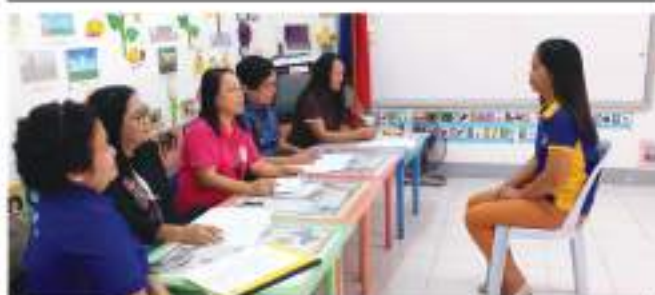
The Provincial Inter-Agency Monitoring Task Force (PIAMTF) validates team conduct personal interview to one of the nominees for the 2018 Search for Outstanding Day Care Workers for the Province of La Union at the Provincial Social Welfare and Development Office, City of San Fernando, La Union on October 18, 2018.