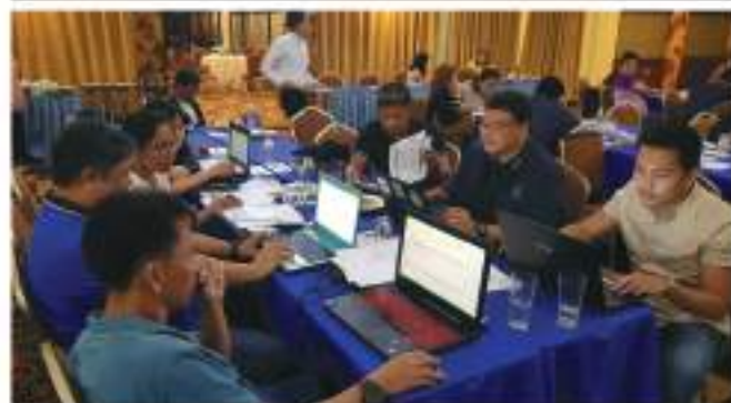
Provincial Government of La Union representatives participate in the workshop on the formulation of the Provincial Governance Reform Roadmap (NGRR) or local road management and public financial management held on October 15 to 17, 2018 at Hotel Strossberg, Clark, Pangasinan. The workshop aimed to align the Conditional Matching Grant to Provinces (CMGP) to the Sustainable Development Goals in partnership with the Department of the Interior and Local Government - CMGP and the United Nations Development Program. Participating Offices were Provincial Assessor, Planning and Development, Engineering, Treasury, Accounting, Bids and Award Committee and General Services.