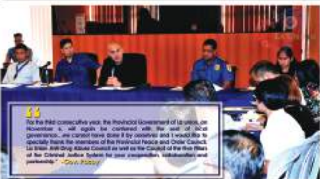
Gov. Pacey highlights the contributions of the Provincial Peace and Order Council (PPOC), La Union Anti-Drug Abuse Council (LUAADAC) and the Council of the Five Pillars of Criminal Justice System (CFPJS) in the Provincial Government of La Union's attainment of its third Seal of Good Local Governance (SGLG) Award during their joint meeting held at the Diego Silang Hall, Provincial Capitol, City of San Fernando, La Union on October 04, 2018.

“ For the third consecutive year, the Provincial Government of La Union, on November 3, will again be honored with the seal of local governance. We cannot have done it by ourselves and I would like to specially thank the members of the Provincial Peace and Order Council, La Union Anti-Drug Abuse Council as well as the Council of the Five Pillars of the Criminal Justice System for their cooperation, collaboration and partnership.” Gov. Pacey