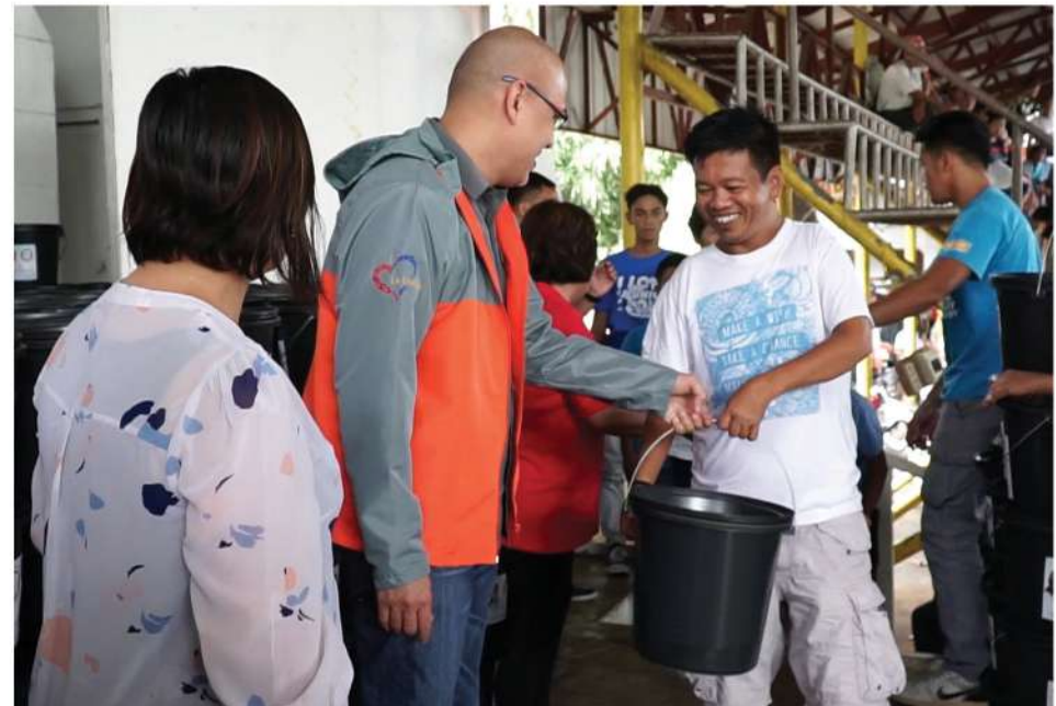
LOVE IN A BUCKET. Gov. Pacoy spearheads the program I Love La Union, I Love My Barangay at the Municipal Covered Court of Pugo, La Union on August 23, 2018 by leading the distribution of buckets of goods to the residents of the municipality. The program also includes Medical and Dental Services, Wellness Massage, Legal Aid, Seeds and Seedling Distribution, and Supplemental Feeding Program.