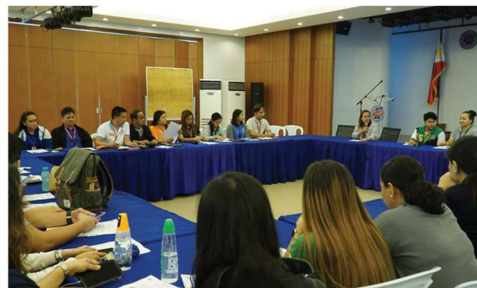
Members of the Governor Press Corps (GPC) convene for their first meeting on August 14, 2018 at the Diego Silang Hall, Provincial Capitol, City of San Fernando, La Union. GPC is a group that provides relevant, timely, and accurate news about the projects, programs and activities of the Provincial Government of La Union to its citizens.