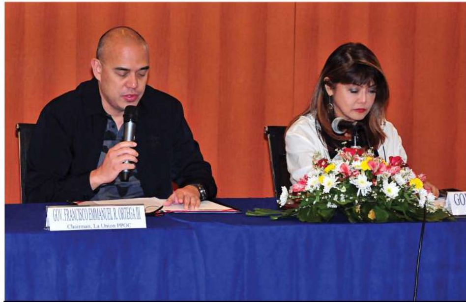
Gov. Pacoy highlighted peace, order and safety as major priority to achieve all the goals of the provinces in Region 1 during the 2nd Regular Regional Peace and Order Council (RPOC) Meeting at the Diego Silang Hall, Provincial Capitol, City of San Fernando, La Union.

The Provincial Government of La Union, headed by Gov. Francisco Emmanuel "Pacoy" R. Ortega III, hosted the Second Regular Regional Peace and Order Council (RPOC) 1 meeting on August 8, 2018 at the Diego Silang Hall, Provincial Capitol, City of San Fernando, La Union.