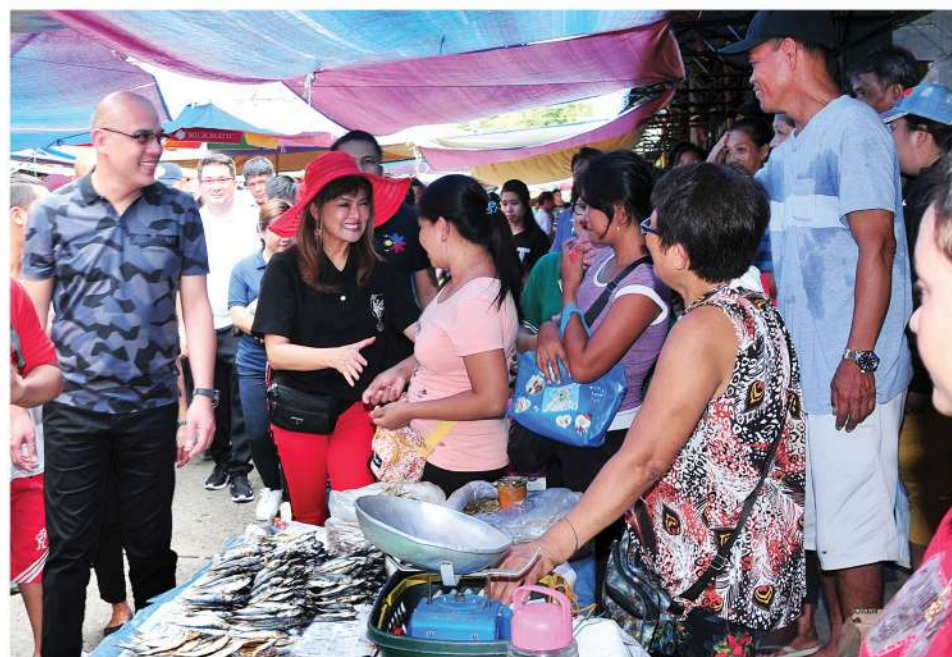
Gov. Pacoy and Ilocos Norte Gov. Imee Marcos visit the City Market of San Fernando, La Union and checked for price inflations during their City Market Tour on August 8, 2018.