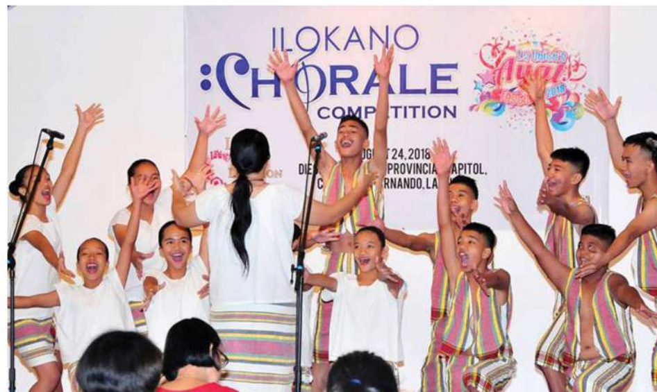
Old Sudipen National High School Chorale performs their winning piece during the Chorale Competition held at the Diego Silang Hall, Provincial Capitol Building, City of San Fernando, La Union on August 24, 2018. The competition is one of the activities of Ayat Festival 2018. Said group bested 12 other contestants from various municipalities of La Union.