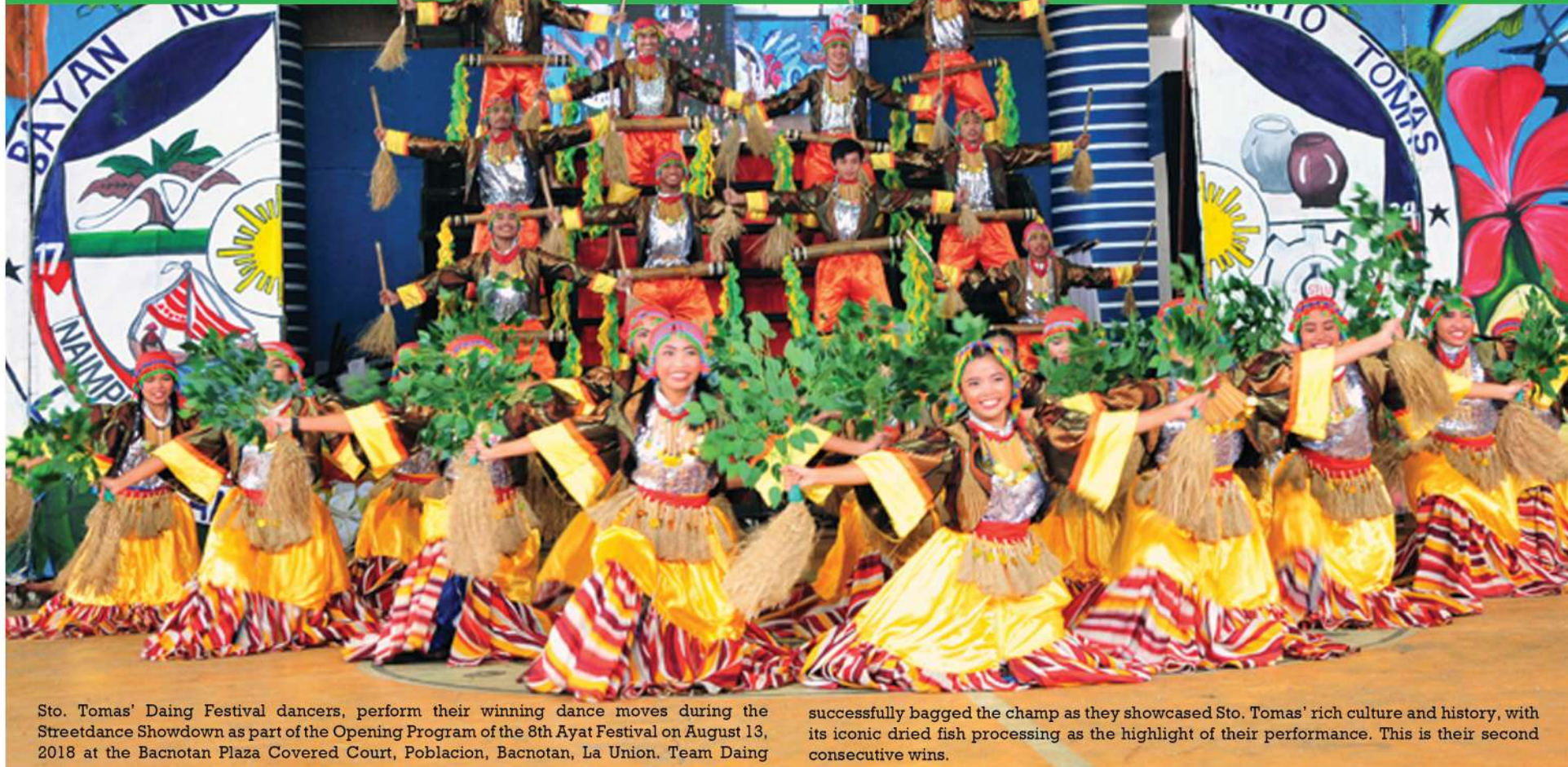
Sto. Tomas' Daing Festival dancers, perform their winning dance moves during the Streetdance Showdown as part of the Opening Program of the 8th Ayat Festival on August 13, 2018 at the Bacnotan Plaza Covered Court, Poblacion, Bacnotan, La Union. Team Daing