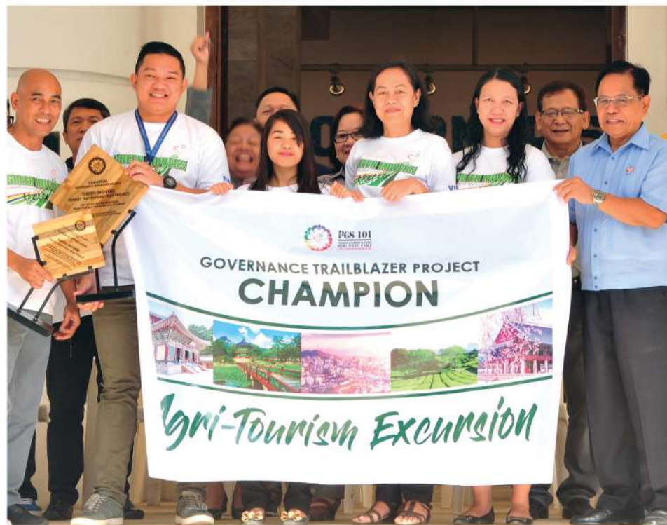
PGLU awards the four participating teams for the Search for the Most Outstanding Governance Trailblazer Project of the Regional Line Agencies (RLAs) during the First Monday Flag Raising Ceremony on August 6, 2018 at the Provincial Capitol Grounds, City of San Fernando, La Union.

The implemented projects of the teams are expected to be sustained, supported, or even turned over to the responsible government units or communities concerned.