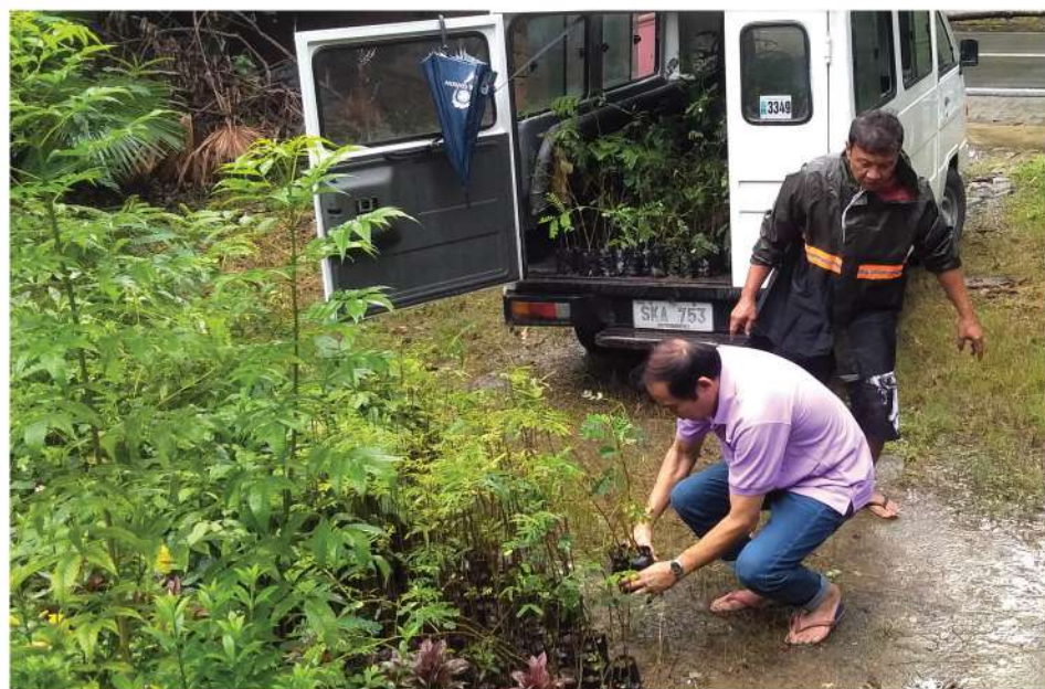
The Provincial Government of La Union - Environment and Natural Resources Unit (ENRU) delivers mahogany, cupang and adaan seedlings to the Local Government Unit of San Gabriel on August 21, 2018 as part of its Forest Resource Management Program and Climate Change Mitigation initiative. A total of 600 seedlings were delivered.