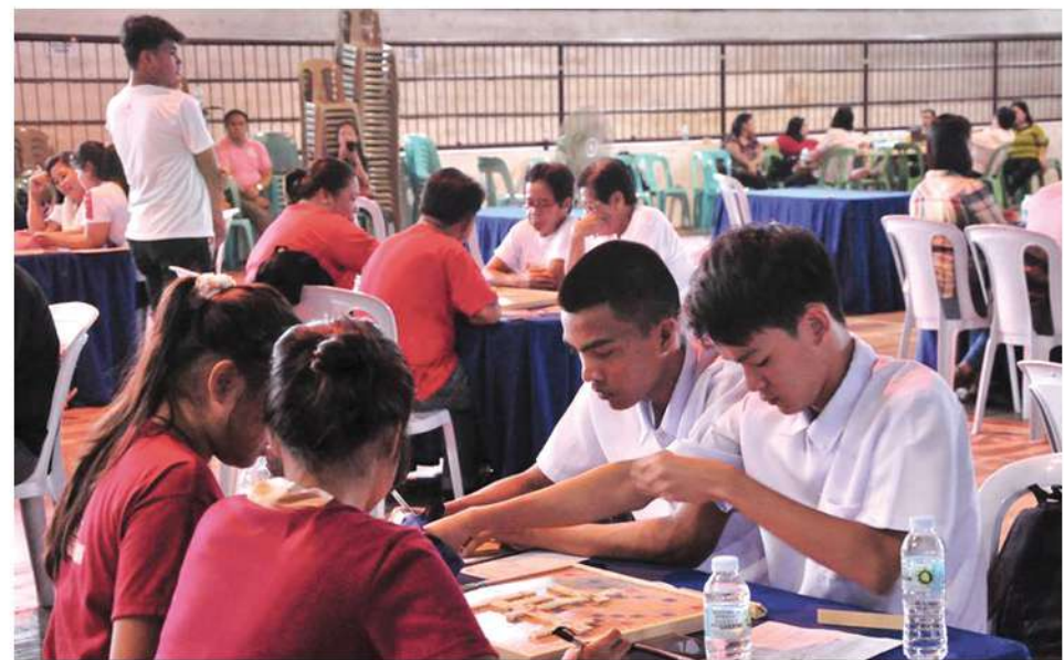
Participants enter their word pieces, which are purely iloko during the Ayat Festival's Iskrabiloko Tournament held at Ortega Gym, City of San Fernando La Union on August 23, 2018.