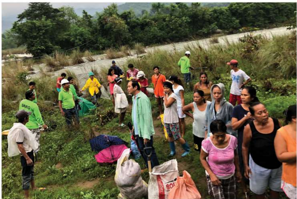
Staffs from the Office of the Provincial Governor-Environment and Natural Resources Unit in partnership with Local Government Unit of Pugo, La Union conduct a creek clean up drive in Brgy. Poblacion East and Brgy. Cares, Pugo La Union on August 22, 2018. This is to prevent flooding during this rainy season.