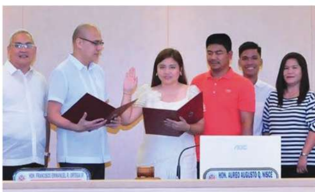
06 LU SK PRESIDENT TAKES OATH AS EX-OFFICIO SPM