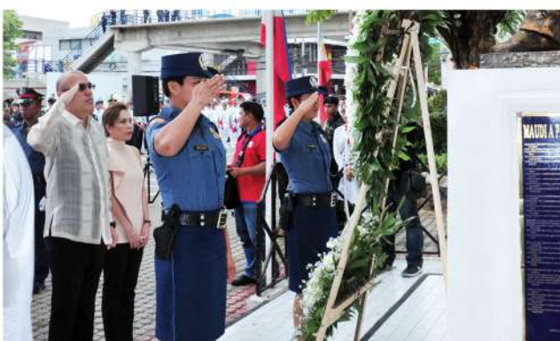
02 LA UNION COMMEMORATES INDEPENDENCE DAY 2018