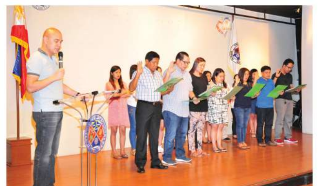
08 TOUR OPERATORS ASSOCIATION FORTIFIES ITS CREATION