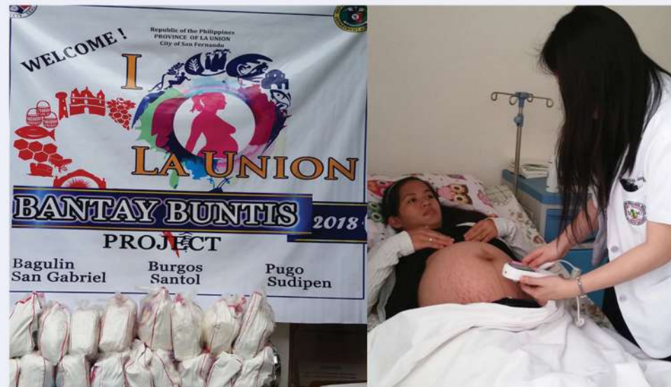
One of the pregnant residents of Bagulin, La Union is being checked during the "Bantay Buntis Project" held on June 13, 2018 in Bagulin La Union. This activity of the Provincial Health Office is aligned to the Millenium Development Goal which aims to lower the maternal and infant mortality and morbidity of the province thus leveraging the quality of life of the mother and child. Necessary services were rendered such as prenatal check-up, dental check-up and giving of buntis kits to recipients.