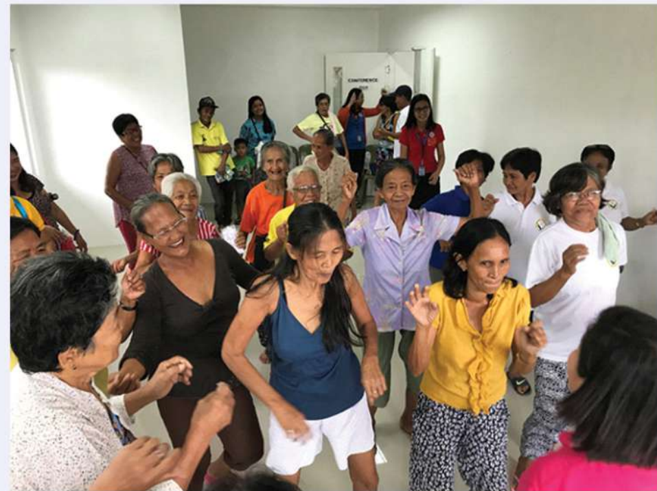
Senior Citizens of Barangay San Jose, Caba, La Union actively participate in a Zumba Exercise for elderly during the Caba District Hospital Community Outreach Program for Senior Citizens on June 13, 2018 at Brgy. San Jose Lying Inn, San Jose, Caba, La Union.