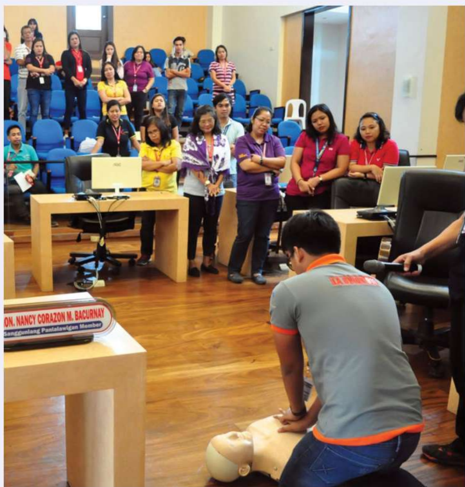
The Philippine Disaster Risk Reduction and Management (PDRRM) team discusses first aid and basic life support concepts and principles to the Sangguniang Panlalawigan Secretariat and Staff during the disaster preparedness orientation on June 22, 2018 at the Speaker Pro-Tempore Francisco I. Ortega Provincial Legislative Building and Session Hall, Provincial Capitol, City of San Fernando, La Union. Proper administration of Cardiopulmonary Resuscitation (CPR) was demonstrated by a PDRRM staff.