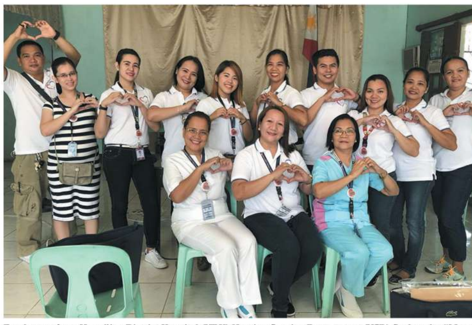
Employees from Naguilian District Hospital (NDH) Nursing Service Department (NSD) flashes the "I Love La Union" sign during the First Ever Orientation on Policies and Protocols on April 16, 17 & 20, 2018 at the Old Senior Citizen's Office in Natividad, Naguilian, La Union. This event was launched to make hospital personnel aware of NSD's mission, vision, goals; policies and procedures.