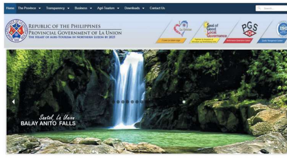
Northern Luzon by 2025" during the 4th Cabinet's Meeting on April 10, 2018 at the Diego Silang Hall, Provincial Capitol Building, City of San Fernando, La Union.