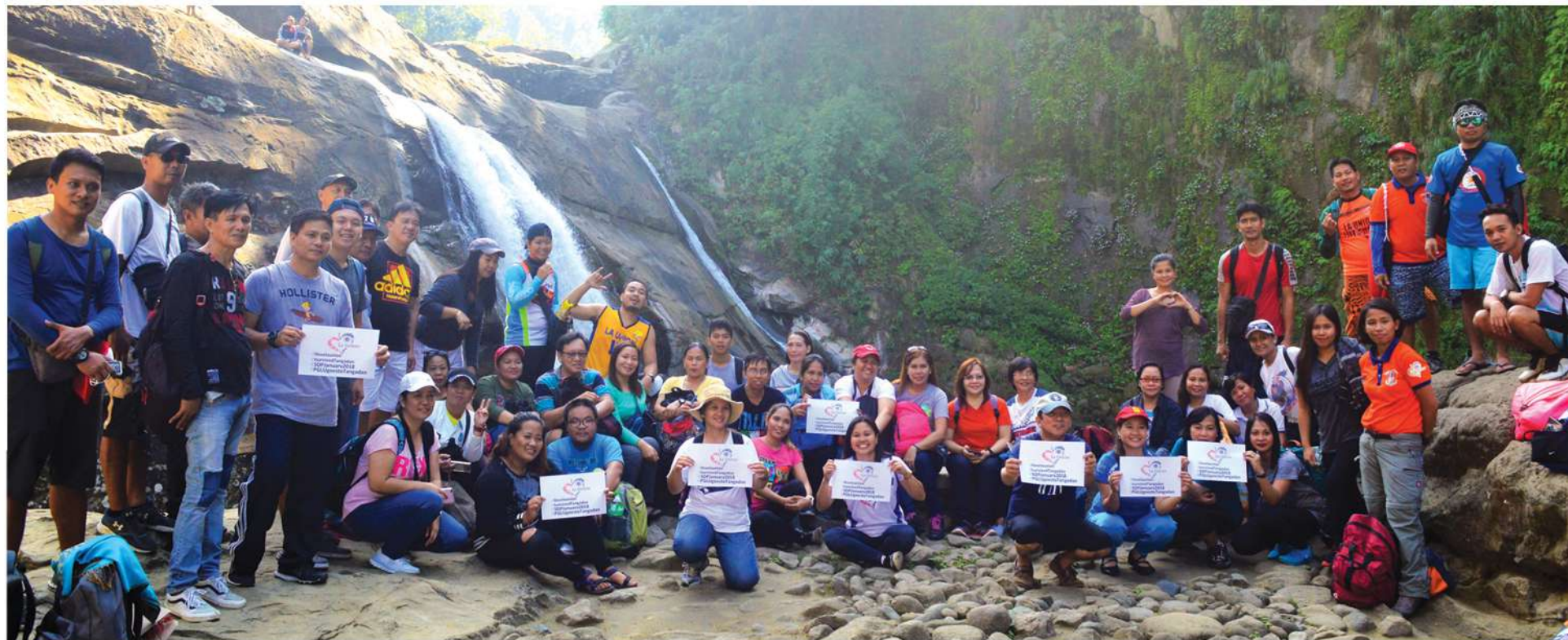
With the advocacy of promoting tourism industry, January born employees of the Provincial Government of La Union (PGLU) take a pose before dipping in the refreshing water of Tangadan Falls, Brgy. Amontoc, San Gabriel, La Union on January 26, 2018 for the monthly PGLU Staff Development Program. They also had lunch and yoga sessions at the Lotus Valley in Brgy. Dasay, San Juan, La Union. These activities are in line with province's vision to make La Union the Heart of Agri-Tourism in Northern Luzon by 2025.