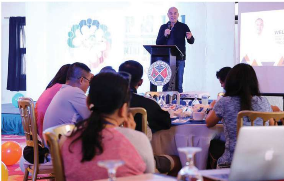
Gov. Pacoy greets representatives from various Regional line Agencies during the opening of PGS Mini Boot Camp (MBC) on January 29, 2018 at Agora Event Center, Thunderbird Resort, Poro Point, City of San Fernando, La Union. This event aims to strengthen partnership between the PGLU and different Regional line agencies to attain the vision of the province to become the Heart of Agri-Tourism in Northern Luzon by 2025.