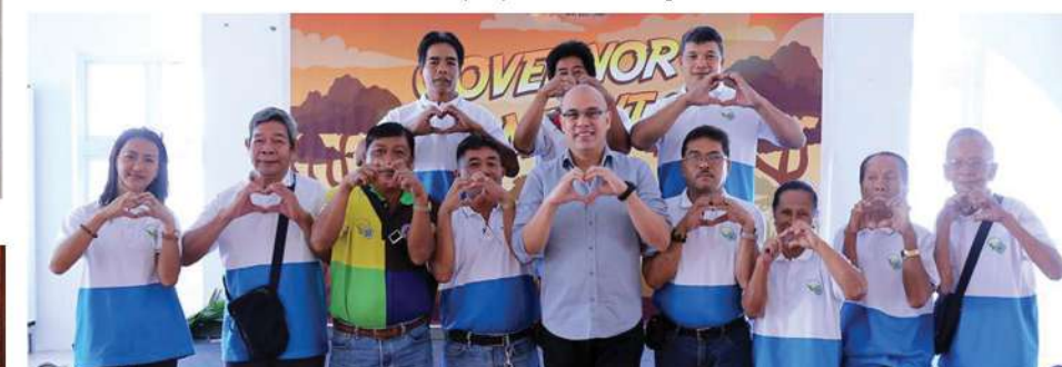
Representatives of Provincial Agriculture and Fisheries Council- La Union