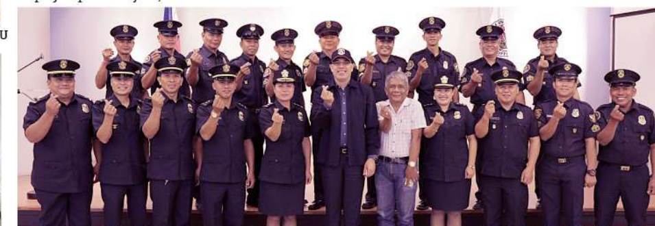
Fire Marshalls from Bureau of Fire Protection (BFP) in the 20 Municipalities in La Union.