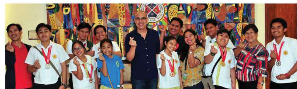
Math Wizards from Brain and Heart of a Christian Institution Inc.