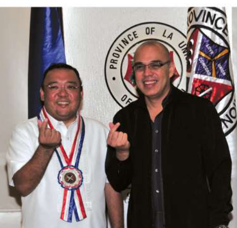
Sec. Harry Roque, Presidential Spokesperson