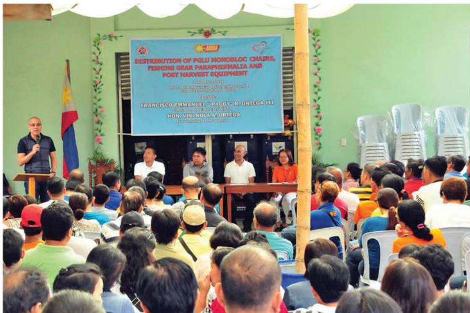
Gov. Pacoy welcomes Barangay Captains and Kagawads during the Distribution of monobloc chairs, fishing gear paraphernalia and post-harvest equipment on January 18, 2017 at the Office of the Provincial Agriculturist (OPAG) Grounds, City of San Fernando, La Union.