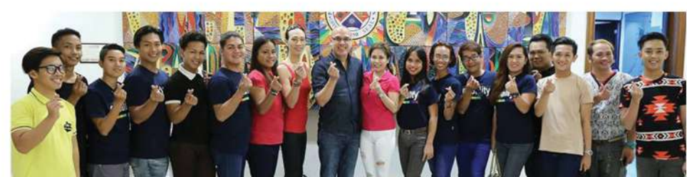
Representatives of LGBT Naguilian.