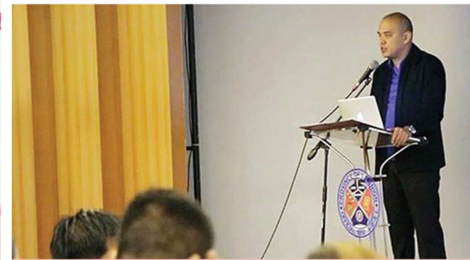
BRIDGING THE GAP BETWEEN LGUS AND REGIONAL LINE AGENCIES. Gov. Pacoy convened the second phase of bridging the gap sessions among the Provincial Government of La Union (PGLU) and various regional line agencies on Thursday, September 14, 2017 at the Diego Silang, Provincial Capitol, City of San Fernando, La Union.

The Provincial Government of La Union (PGLU) headed by Governor Francisco Emmanuel "Pacoy" R. Ortega III welcomes the participants of the Bridging the Gap: Convergence of Agencies Part II on September 14, 2017 at the Diego Silang Hall, Capitol Building, City of San Fernando La Union.