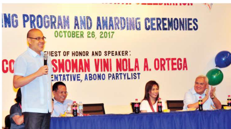
Gov. Pacoy gives an inspiring message on empowering marginalized groups and uplifting their economic status and quality of life during the Cooperative Month Culminating Program and Awarding Ceremonies on October 26, 2017 at the Diego Silang Hall, Provincial Capitol, City of San Fernando, La Union.