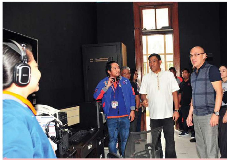
Gov. Pacoy together with Department of Interior and Local Government (DILG) ASec Nestor Quinsay check the operations of the La Union 911 on October 24, 2017 at the La Union Provincial Capitol, City of San Fernando, La Union. The 911 Hotline which was launched earlier this year, aims to ensure immediate rescue and disaster response during emergencies.