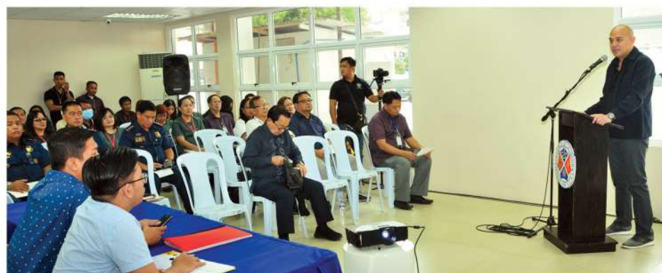
Gov. Pacoy welcomes guests and participants to the Seal of Good Local Governance (SGLG) National Validation on Aug 24, 2017 at the Pasalubong Center, Mabanag Justice Hall, City of San Fernando, La Union. The said event led by the SGLG National Assessment Team of the Department of Interior and Local Government (DILG) aims to validate the Provincial Government of La Union's completion of all the areas of Good Local Governance.