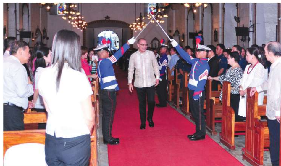
THE ENTRANCE FOR THE SOPA. Gov. Pacoy enters the Saint William the Hermit Cathedral and greeted by officials of Local Government Units (LGU) of La Union including Mayors, Vice Mayors, Councilors and Regional Directors of National Line Agencies and officers and members of Civic Groups and Non-government Organizations on July 27, 2017 in San Fernando, City La Union.

heads of key line agencies, department heads and employees of the PGLU, local chief executives and people from the different municipalities and city of La Union. Sen. Joseph Victor "JV" G. Ejercito also graced the event as a guest and witness to the Governor's commitment to aligning programs in the province towards supporting the national government and leadership. For convenience, the SOPA may be viewed as it was livestreamed through the official Facebook page of the Provincial Government of La Union (PGLU). -Marcel A. Florentino