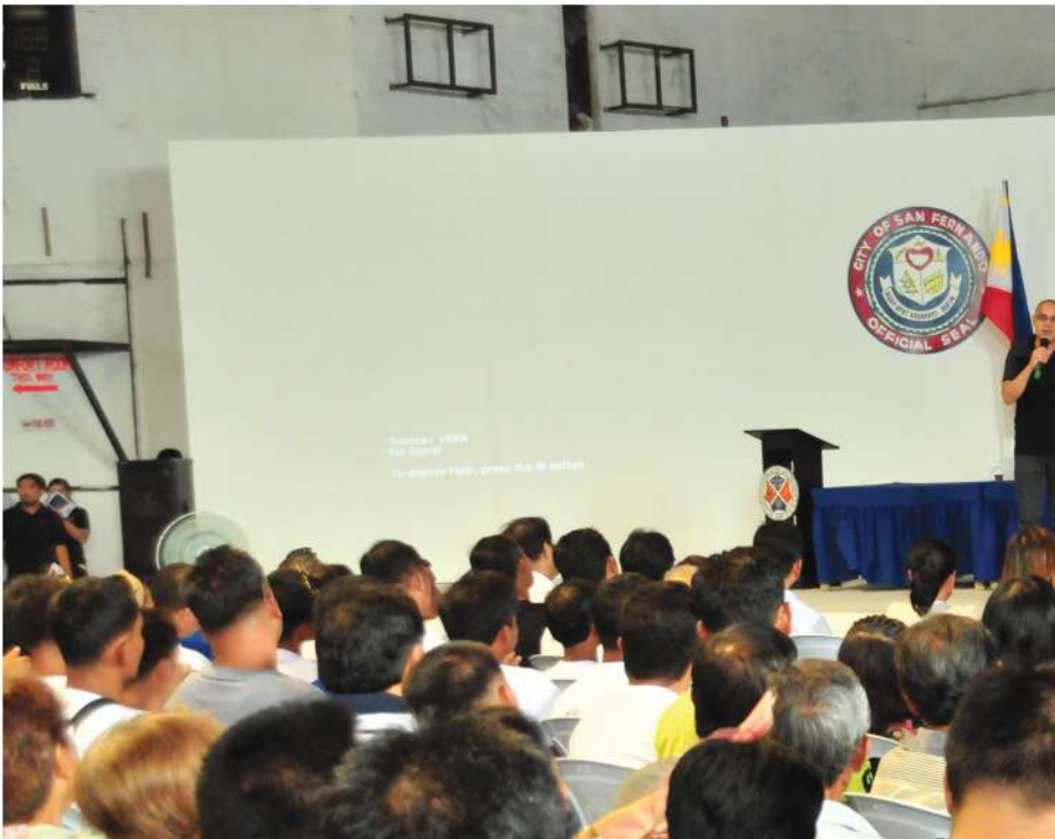
Gov. Pacoy emphasizes his plans for Transformative Governance aligning with the directives of the National Leadership battle cry for Solidarity and Good Governance during the Federalism Forum and Consultation on August 24, 2017 at the Ortega Gym, City of San Fernando, La Union.