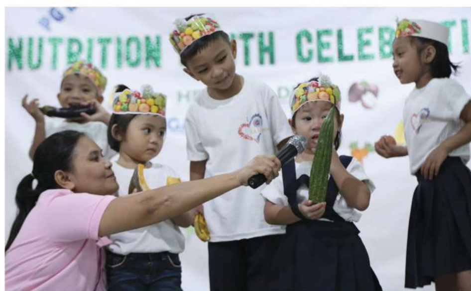
A pre-kinder pupil from the Provincial Government Child Development Center (PGCDC) shows her favorite vegetable while telling its nutritional values during their celebration of Nutrition Month with the theme "Healthy Diet, Gaining Habit for Life" on July 28, 2017 at the La Union Technology and Livelihood Development Center (LUTLDC). The said event aims to inform the parents on the benefits of good health and nutrition to growing kids.