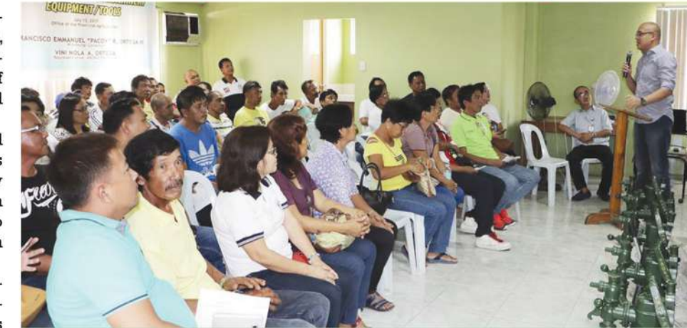
SPREADING THE LOVE AMONG FARMERS. Gov. Pacoy does out farm equipment and machines to barangay captains and councilors of the different Municipalities in the province on July 13, 2017 at the Office of the Provincial Agriculturist, City of San Fernando, La Union. These equipment and machines will be dispensed to farmer-recipients in their communities.

The Provincial Government of La Union (PGLU) led by Gov. Francisco Emmanuel R. Ortega III in partnership with ABONO Agri-Tourism in Northern Luzon by 2025. According to him, the province will be more prosperous when its strength in agriculture is augmented not only in terms of crop yield but also supplemented with tourism.