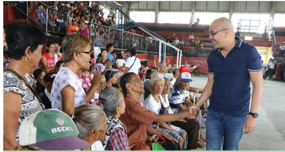
SHARING THE LOVE AMONG TYPHOON VICTIMS. Gov. Pacoy shakes hand with one of the elderly persons affected by the 2018 super typhoon Lando during the distribution of their Emergency Shelter Assistance (ESA) on July 11, 2017 at Luna, La Union Covered Court. The said assistance empowers and gives inspiration to the victims amidst the harm and damages caused by the storm.