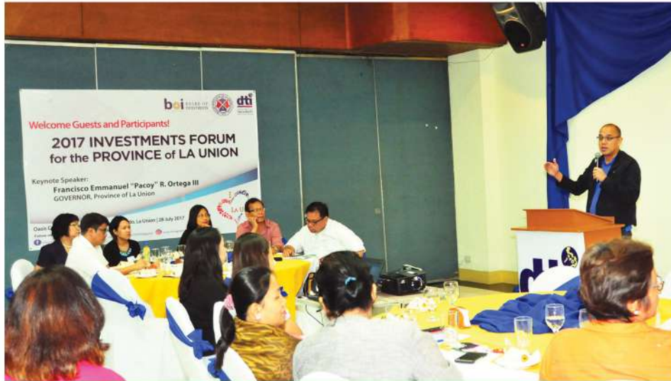
Gov. Pacoy imparts the initiatives of the Provincial Government of La Union related to upgrading business industry in La Union aiming to generate more income and employment for the people during the 2017 Investment Forum for the Province of La Union on July 28, 2017 at the Oasis Country Resort. The Department of Trade and Industry La Union (DTI-LU) Investment Specialists foresee La Union as springboard of Business and Commerce in the North since it has a strategic location open for trade and investment.