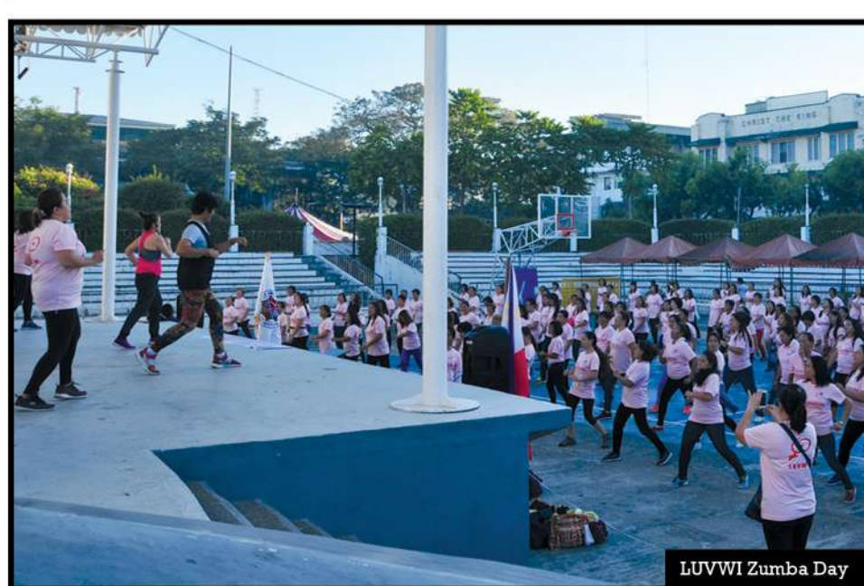
LUVWI Zumba Day