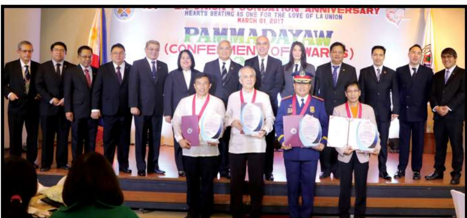
Recipients of the Diego Silang Award poses with La Union officials during the Pammadayaw 2017 on March 1, 2017 at the Diego Silang Hall, Provincial Capitol, City of San Fernando, La Union.