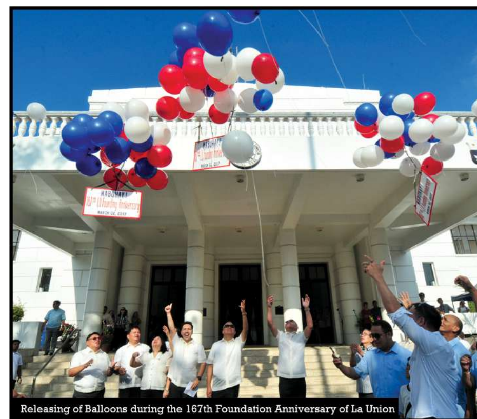
Releasing of Balloons during the 167th Foundation Anniversary of La Union