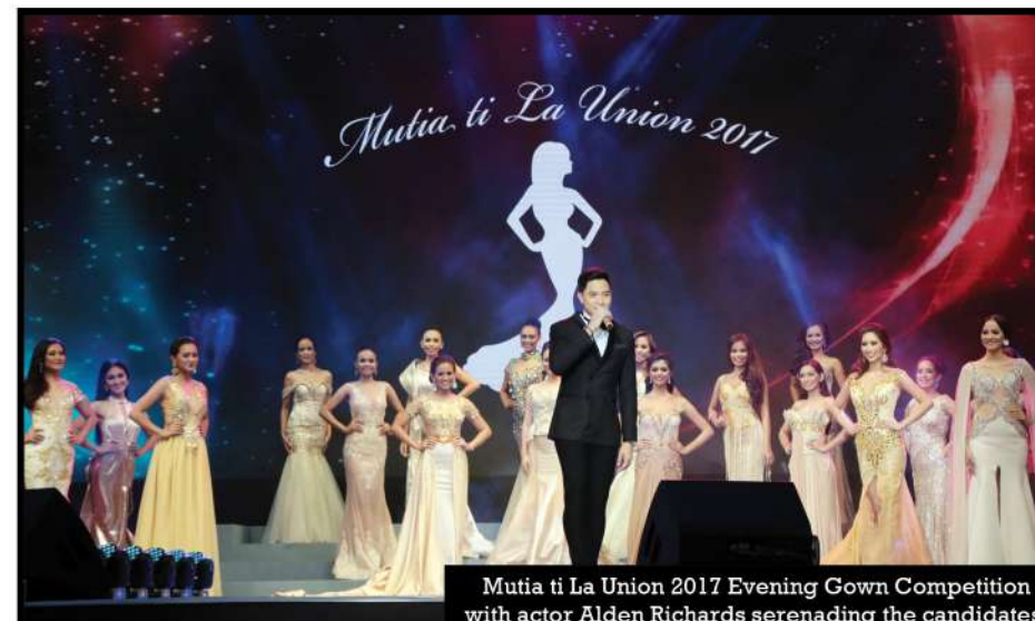
Mutia ti La Union 2017 Evening Gown Competition with actor Alden Richards serenading the candidates.