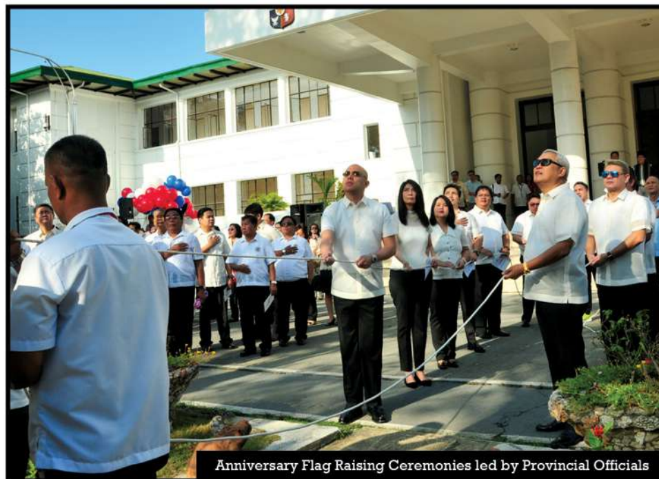
Anniversary Flag Raising Ceremonies led by Provincial Officials