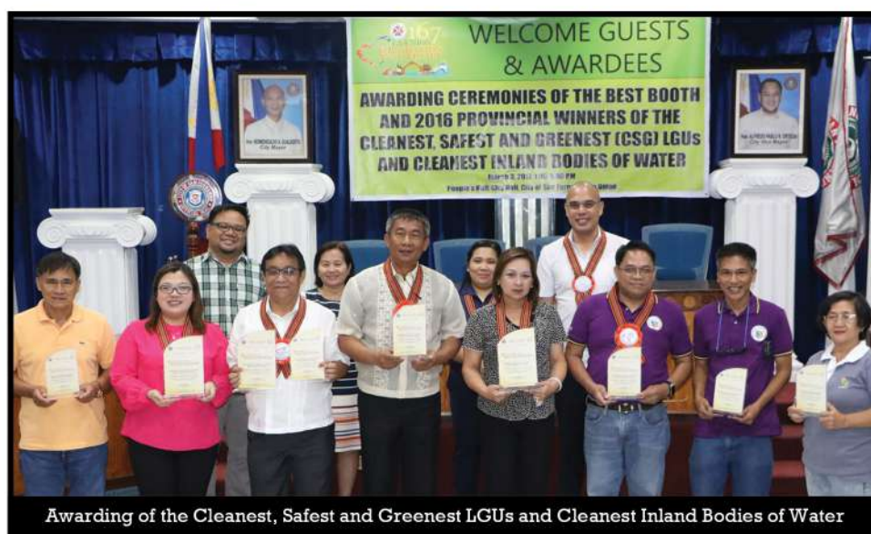
Awarding of the Cleanest, Safest and Greenest LGUs and Cleanest Inland Bodies of Water