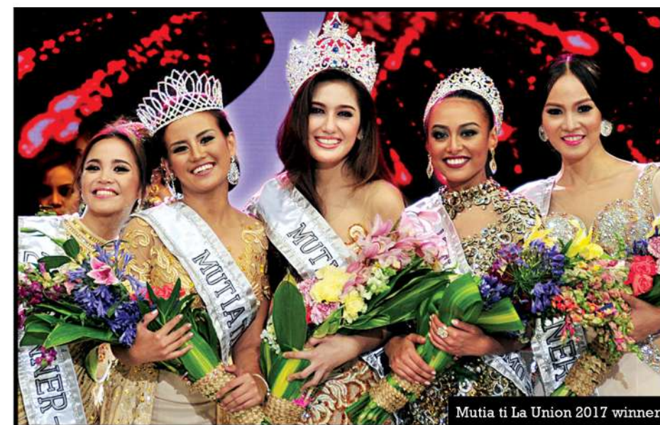
Mutia ti La Union 2017 winners