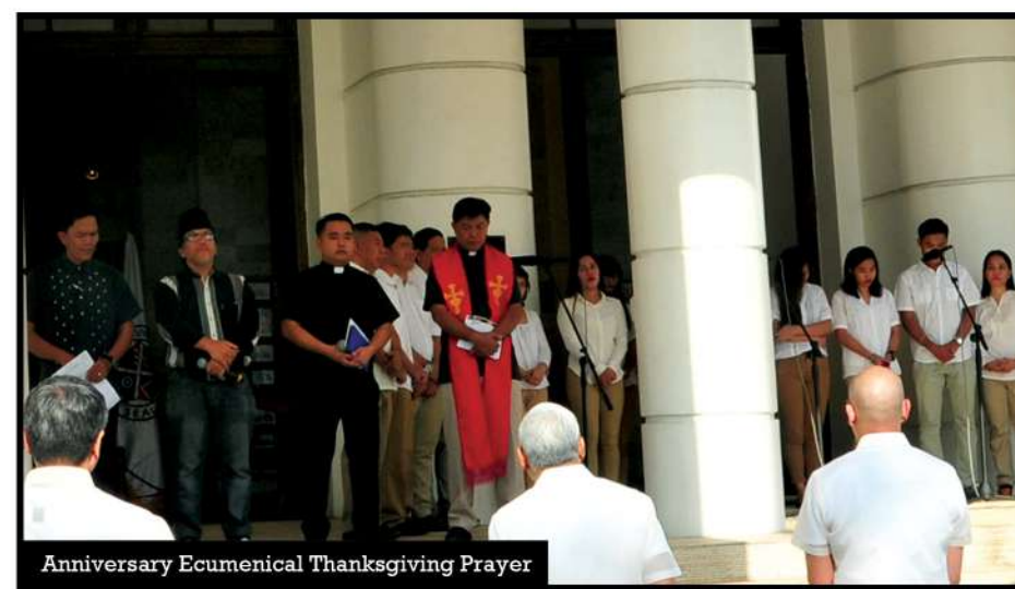
Anniversary Ecumenical Thanksgiving Prayer