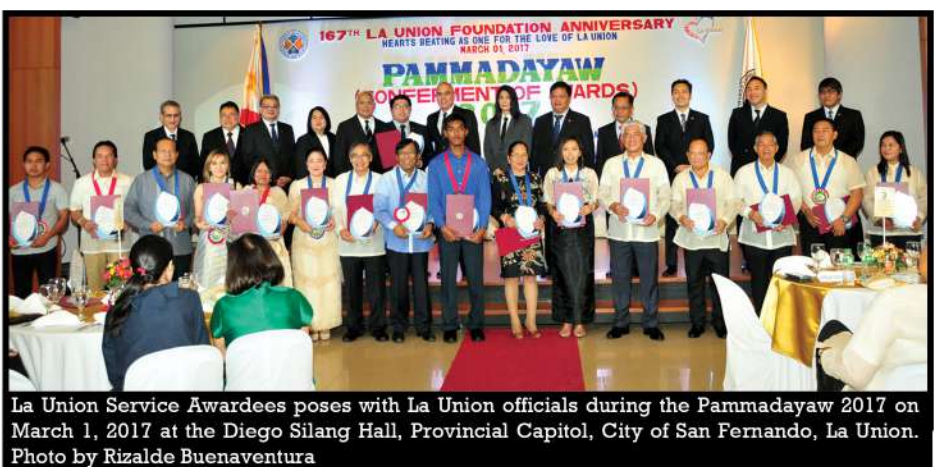
La Union Service Awardees poses with La Union officials during the Pammadayaw 2017 on March 1, 2017 at the Diego Silang Hall, Provincial Capitol, City of San Fernando, La Union.