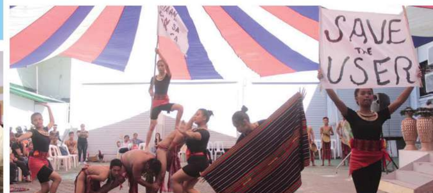
"SAY NO TO DRUGS". The dancers of Tagnaao Dance Troupe show their dance moves during the IP Modern Cultural Dance Competition with the theme "Mga Kabataan Ayaw sa Droga" on December 13, 2016 at the Provincial Capitol Parking Lot, City of San Fernando, La Union. They are the overall champion on the said competition.