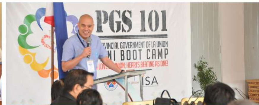
Gov. Francisco Emmanuel "Pacoy" R. Ortega III delivers his inspirational message to the PGLU Officials during the PGS 101: Provincial Government of La Union Mini Boot Camp with the theme "I Love La Union: Hearts Beating as One" on December 6, 2016 at Thunderbird Resorts and Hotel, City of San Fernando, La Union.