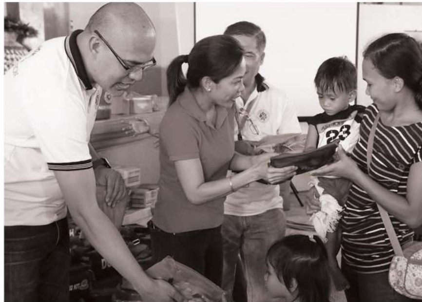
"FOR THE LOVE OF LA UNION"