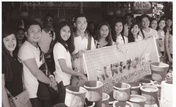
Dagiti estudianten manipud iti nadumaduma a kolehio ti La Union a nakipaset iti "Agri-Tour Your Own Province" idi Setiembre 23, 2016 kas sinelebraran ti probinsia ti Tourism Week.