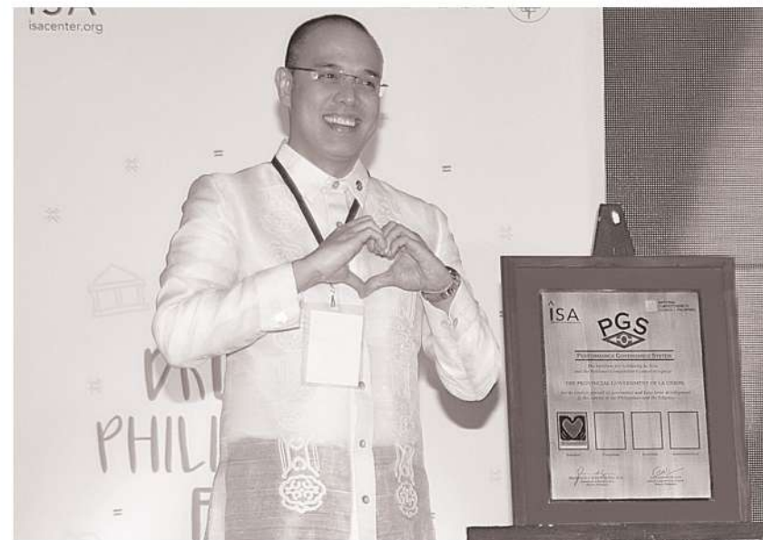
Gov. Francisco Emmanuel "Pacoy" R. Ortega III, proudly showing the iconic I Love La Union Sign after the Provincial Government of La Union (PGLU) passed the Initiation Stage of the Performance Governance System (PGS) as he successfully defended the Vision of the province "to become the Heart of Agri-Tourism of Northern Luzon by 2025" through a Public Revalida organized by the Institute for Solidarity in Asia during the Dream Philippines Fair held on October 18, 2016 at the M.K. Tan Auditorium of the Bayanihan Center, Unilab Compound, Pasig City.